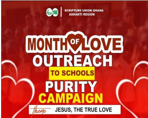
Figure 1: Jesus, The True Love flyer

SU responds by running campus programmes that address sex-related issues among the youth from a Christian perspective. This approach is employed through a programme called 'Purity Campaign.' Particularly, during Valentine's Day every year, the SU takes advantage of the euphoria in society and the catchphrase of 'Month of Love' to capture the attention of the youth and presents 'Jesus the True Love.' Fliers are designed as invitation notices for students who are not members of the fellowships. The picture below is the 'Purity Campaign' flier for 2022.