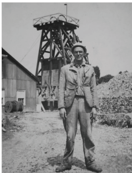
Danie Krige learning the trade, 1939.

Born in Bothaville, Free State, on the 26 August 1919, Daniel G. Krige grew up in Krugersdorp, matriculating from Monument High School in Krugersdorp in 1934 at the age of 15. He graduated with a BSc(Eng) degree in mining engineering from the University of the Witwatersrand at the end of 1938 (aged 19). In 1938 he joined Anglo Transvaal where he worked on a number of gold mines until 1943, gaining a wide range of valuable practical experience in surveying, sampling and ore valuation. He then joined the Government Mining Engineer's Department where he worked for eight years before returning to industry as Group Financial Engineer of the Anglovaal Group. He held this post until 1981, after which he spent 10 years as Professor of Mineral Economics at the Witwatersrand University. He remained a registered Professional Engineer although his activity as a consultant naturally diminished.