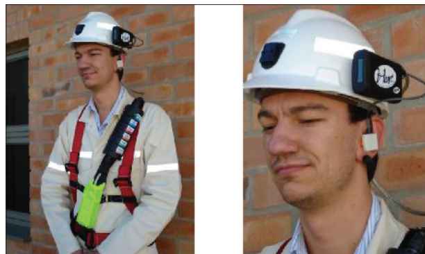
Figure 1—DAPU and harness