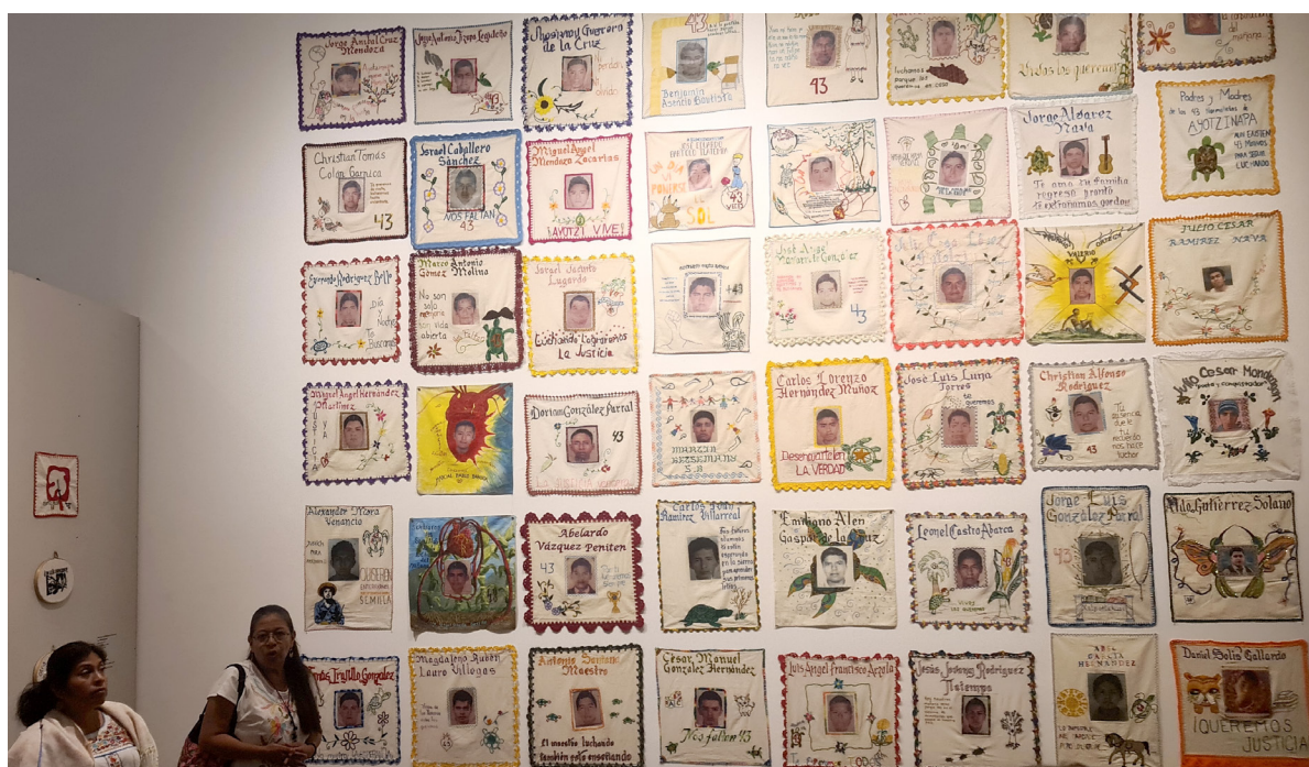
FIGURE Nº 4

Embroidery is not only the subject of the exhibition, it is also a central practice of the gathering itself. In a context of extreme violence, social precarity, and state absence, it becomes a radical act of dissent: a gesture of political care and aesthetic refiguration that makes violence visible across the Americas, resists its normalisation, and invites shared mourning and solidarity. The event is more than a meeting – it is a “ Punto de Cruce ”: a crossing point, a moment where threads intersect, stories meet, and movements connect. Together we laugh and cry. The voices of the mothers, the searchers, the disappeared, the murdered – they are all here. In the fabric. In the room. In us.