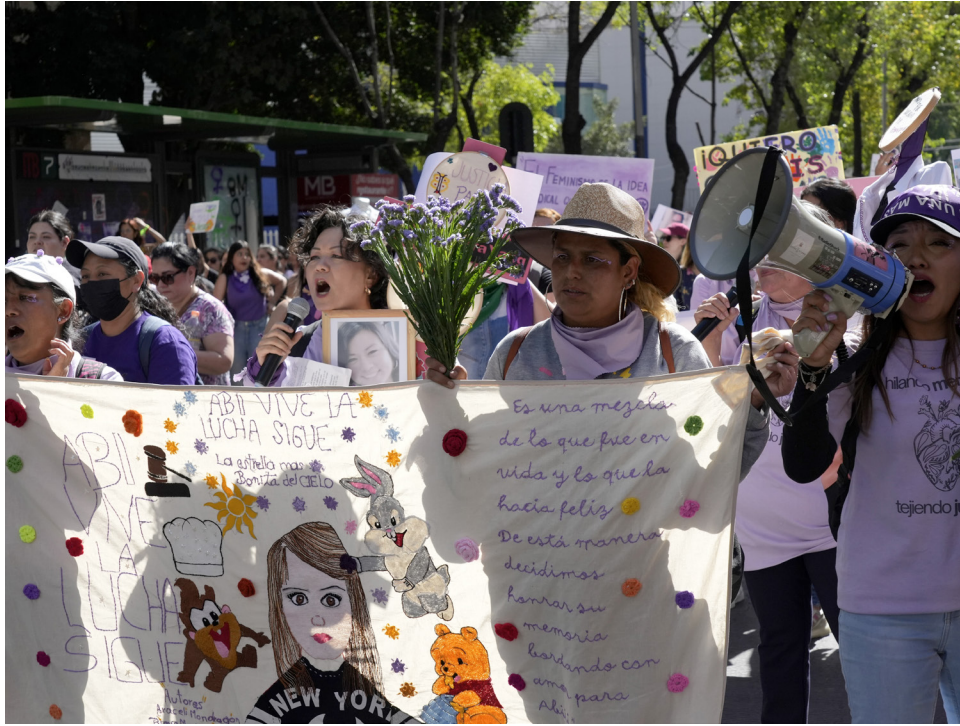
FIGURE Nº 3