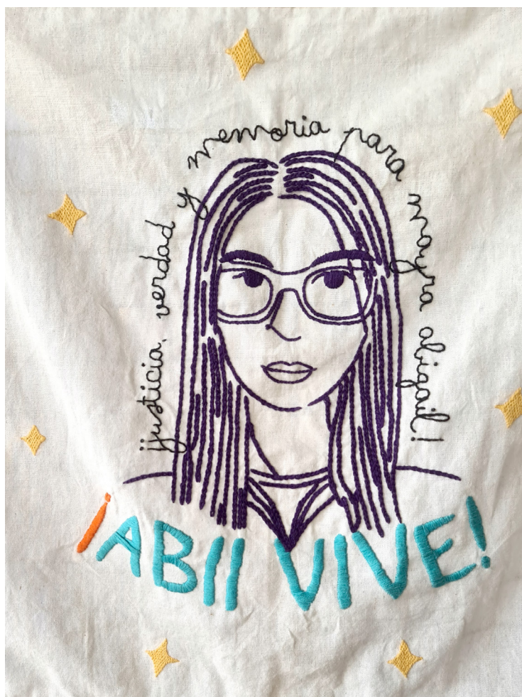
FIGURE Nº 9

As a manual, collective, embodied, and artistic practice, embroidery becomes a powerful medium for articulating “the unspeakable”, enabling the expression of experiences of loss and trauma and facilitating shared mourning. The slow, repetitive rhythm of stitching supports emotional processing when words are inaccessible or overwhelming. In this way, embroidery builds affective communities and opens up spaces of empathy – fostering connection, mutual care, solidarity, and understanding beyond cognitive comprehension. Practised in plazas and exhibited in museums, embroidery becomes a feminist intervention