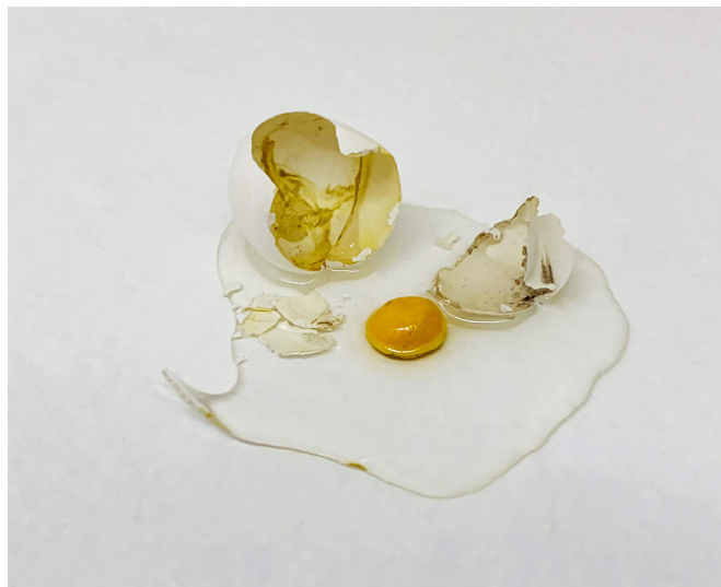
FIGURE Nº 9