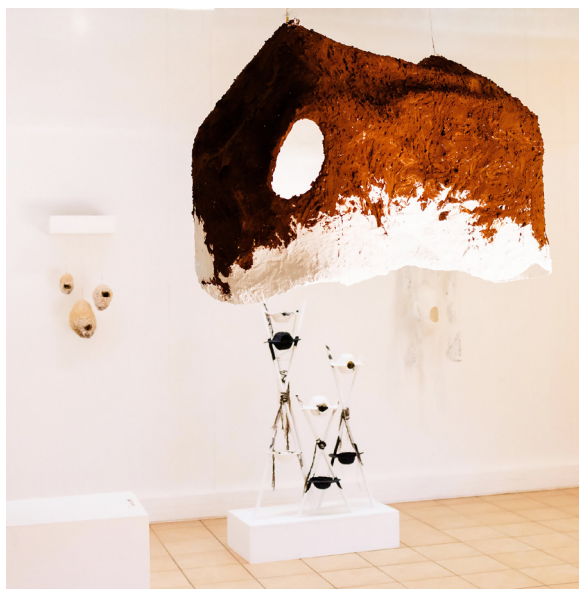
FIGURE N° 6

The viewer is 'confronted' with the large hanging structure of Confrontation (Nest 5) (Figure 6) when approaching The nest sound installation series. In my first encounter with The nest installation series, I was engulfed by The confrontation , finding a quiet space for introspection, with the chattering of birds in the background. The confrontation , the largest individual nest in the series, contains a hollow opening. Heenop (2024) relates that she wanted to create a nest that the viewer could physically enter from below to fully engage with the artwork. The structure is reminiscent of the large community nests of Sociable Weavers constructed in trees or on telephone poles. According to Heenop (2024), The confrontation installation emphasises the interaction of the built nests and sound design to create an opportunity for reflection (Heenop & Steyn 2023:28). Despite the sound of hundreds of birds chirping together, the installation creates a space for contemplation.