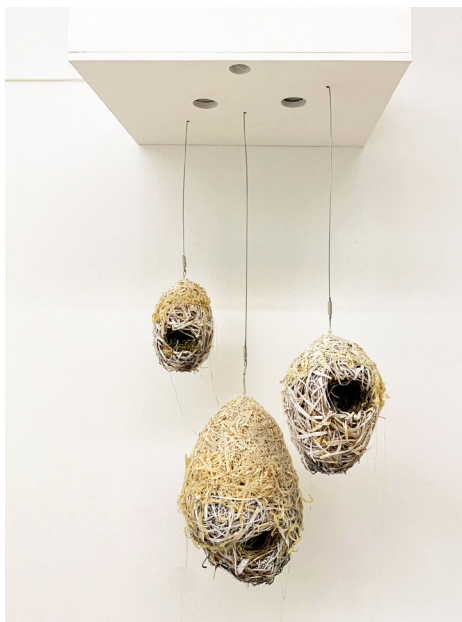
FIGURE N° 10

The time it takes to view The core installation (Figures 1, 9, 10) and listen to the sounds of a morning routine and the dawn chorus of birds slows down the viewing process and captures the viewer. According to Jonathan Gilmurray (2017:34) 'ecological sound art' can offer 'metaphors which facilitate a personal connection with environmental issues'. In this regard, Anna Maria Ochoa Gautier (2016:127) refers to sound as an 'ontological suture' or stitch connecting humans and the environment. I argue that the more complex, layered soundscape of The core and by extension, The nest installation series by Heenop and Steyn highlight more-than-human connections around belonging and transience. Through a fascination with birds and the carefully constructed nests they build, the sculptures by Roets also evoke associations with fragility and transience as well as strength and resilience.