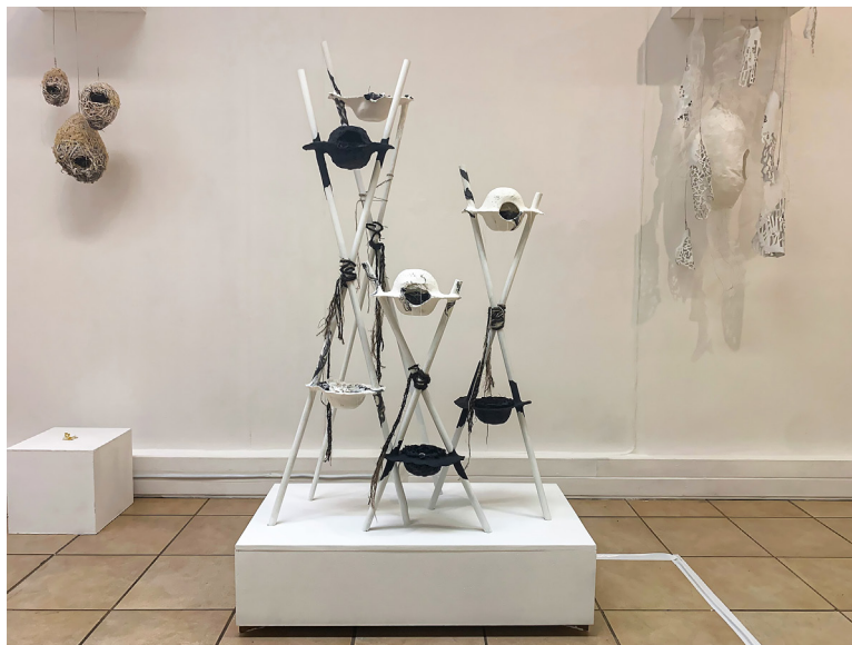
FIGURE N° 4

ciated with human activity in the urban environment, heels clicking on pavements, vehicles honking and a train rushing by. Birdsong is largely absent from The conflict sound installation, with the soft cooing of doves barely audible at the end of the sound loop. The discussion of The conflict can be expanded to refer to the conflict between human and non-human neighbours, with the need to work towards better, more caring relationships.