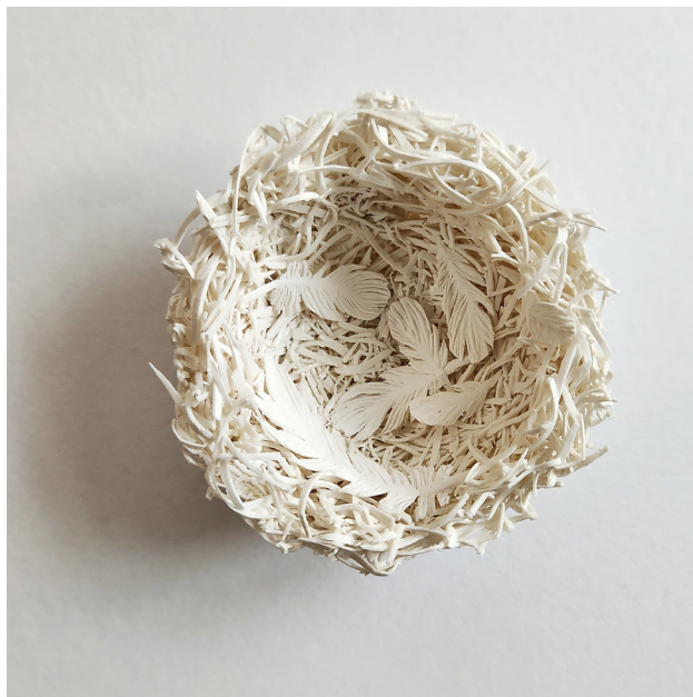
FIGURE Nº 2