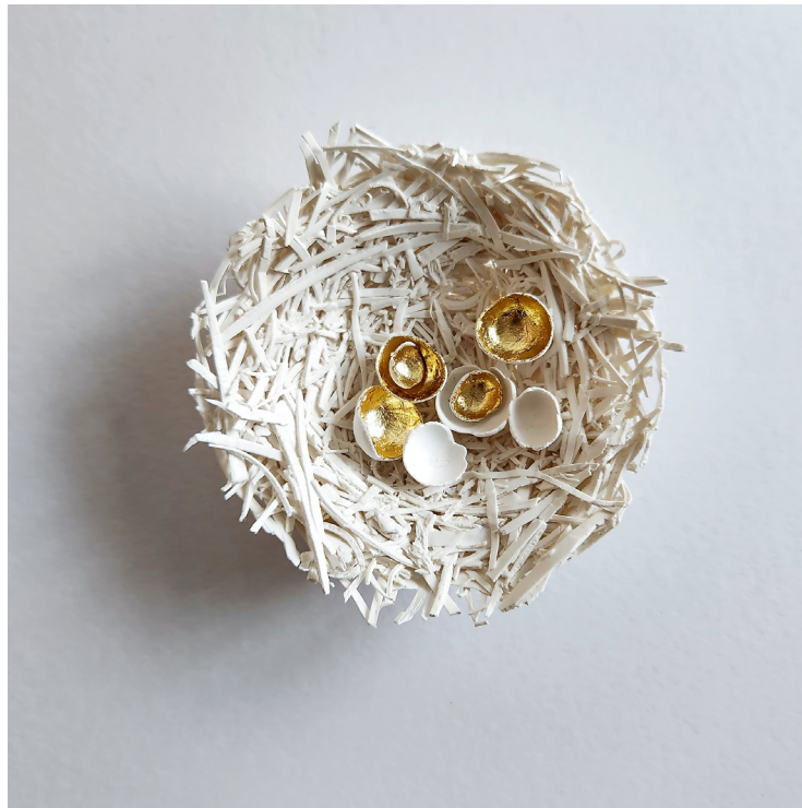
FIGURE Nº 8