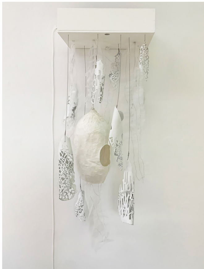
FIGURE Nº 3