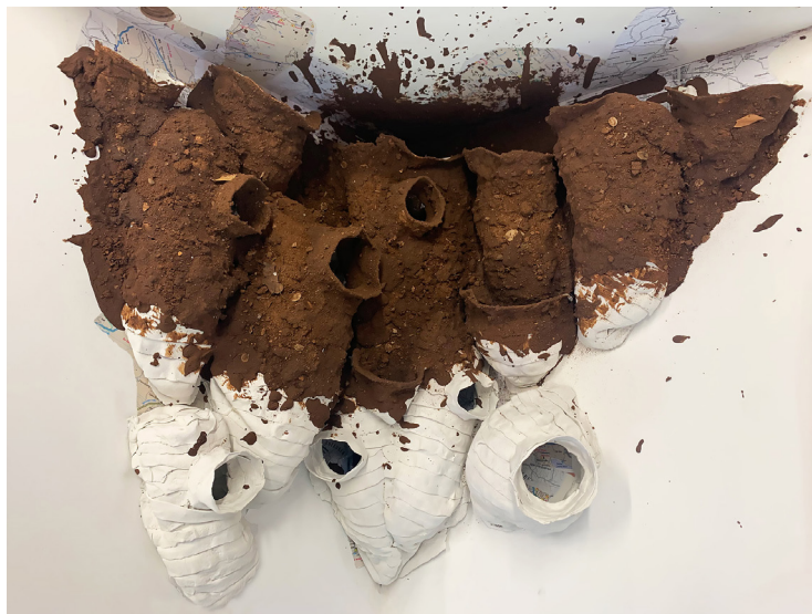
FIGURE Nº 5