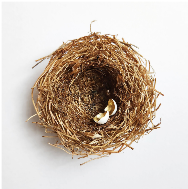
FIGURE Nº 7