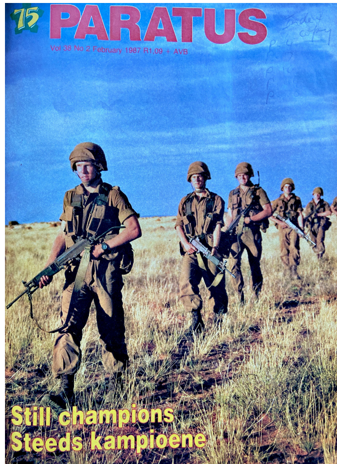
FIGURE N° 1