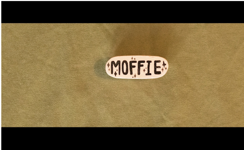
FIGURE N° 2