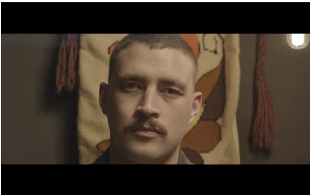
FIGURE N o 4

The central theme of Toekoms Spoke/Future Ghosts is the Southern African Border War, featuring the army conscript (Figure 4) and his reflections on the past, present, and future through video montages of news broadcasts and popular Afrikaans songs, and how this affects his masculinity. In their artists' statement, 5 Fourie, in collaboration with Paula Kruger and Armand Aucamp, notes that the conscript is travelling on a train to join the army due to the mandatory military service for young men. Contextually, Fourie's (see footnote 1) film primarily focuses on the final phases of the Border War in South Africa during the 1980s, reflecting on the conscript's memories, thoughts, and uncertainties during this period.