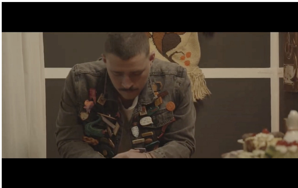
FIGURE N o 8

strategies (Nel 2019:13), highlighting the importance of military readiness against the so-called threat of communism. Furthermore, upon closer inspection, the cover pages highlighted in this article represent the SADF soldier as a ready combatant. In contrast, the military conscript in Toekoms Spoke/Future Ghosts appears uneasy, not “masculine” in the conventional sense, and ridiculously unprepared for his military responsibilities. Specifically, in Figure 8, the conscript looks “uneasy” while travelling by train, acutely aware of his impending military duty and the masculine role he is “obligated” to fulfil.