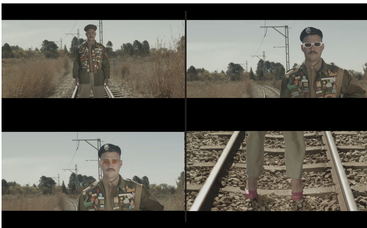
FIGURE N° 10

Further contributing to this ridiculing of heteronormative militaristic masculinity, the short film concludes with the army conscript dressed in women's shoes and effeminate sunglasses alongside his military uniform (see Figure 10). In this context, Fourie's creative agency in the film critiques the homogeneous discourses propagated through propaganda aimed at promoting heteronormative masculine ideals during the Border War. This is particularly evident when Figures 3 and 10 are juxtaposed: Figure 3 depicts SADF soldiers wearing army boots, while Fourie, in Figure 10, defies this heteronormative image by placing women's shoes on the conscript alongside his military uniform. The conscript becomes, rather ridiculously in the context of how masculinity was viewed and promoted, a "drag queen" of sorts. Indeed, the cover pages of Paratus , referred to in this article, interpret the Southern Africa Border War as a type of heterosexual (and heteronormative) conflict in which 'propaganda was used to suppress any questioning of the necessity of the war and the macho world of killing and fighting' (Crous 2006:52).