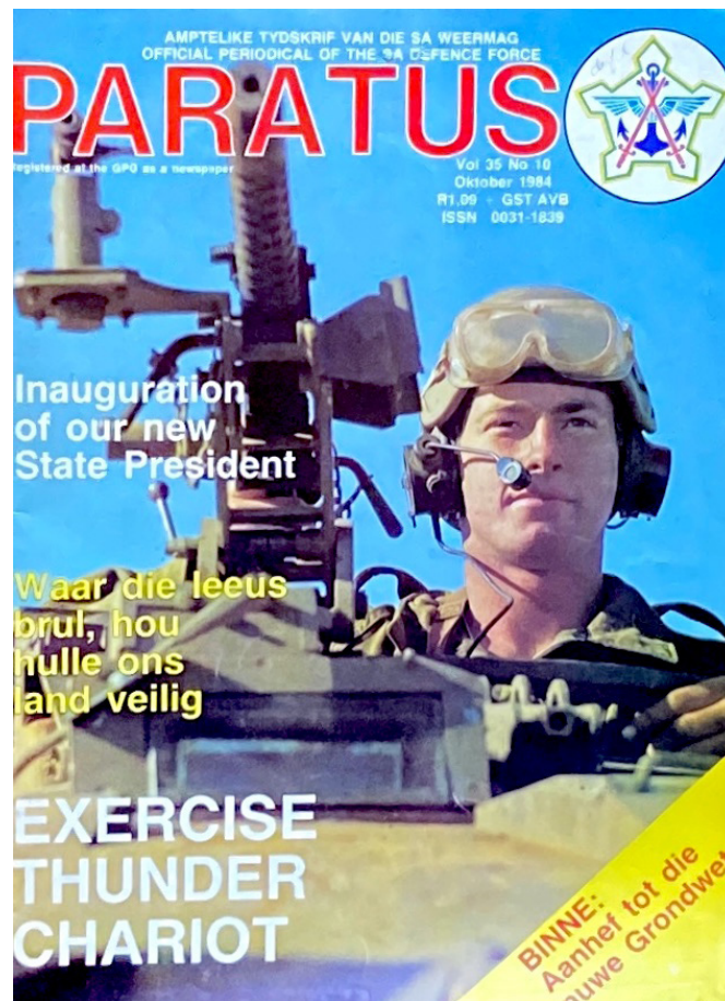
FIGURE N o 7

tolerated (see Du Pisani 2001; Drewett 2008; Boshoff & Conradie 2023; Conway 2012; Pieterse 2013; Baines 2020).