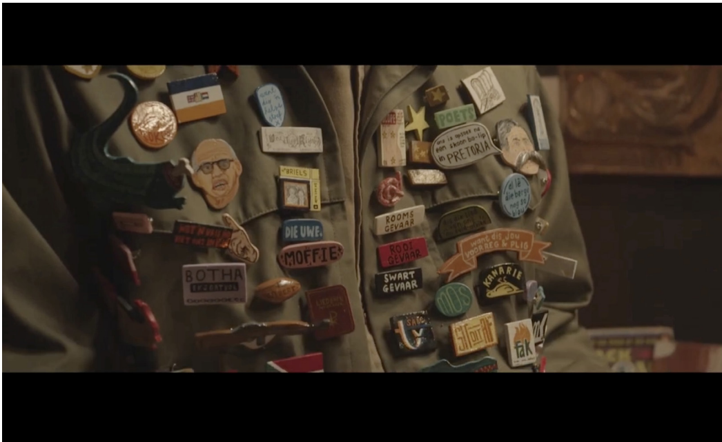
FIGURE N o 5