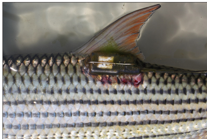
Figure 2. Visible dermal irritation approximately one scale row below the position of the externally attached radio transmitters which was probably caused by movement of the transmitter on a tigerfish recaptured 49 days after tagging in the Kavango River, Namibia. The green algae had to be removed from the transmitter to reveal the tag number