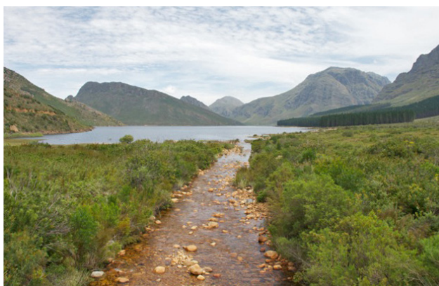
Figure 2 View northwest of the Olifants River entering Wemmershoek Dam. The inflow of the Drakenstein River lies directly opposite (see Fig. 1)

Winterhoek farm are scattered to the north and east of the dam. The natural water quality of this region is typified by acidic conditions, with humic-stained waters draining from fynbos-dominated mountain catchments (Allanson et al. 1990). In summary, the catchment has remained essentially unaltered since the dam was constructed.