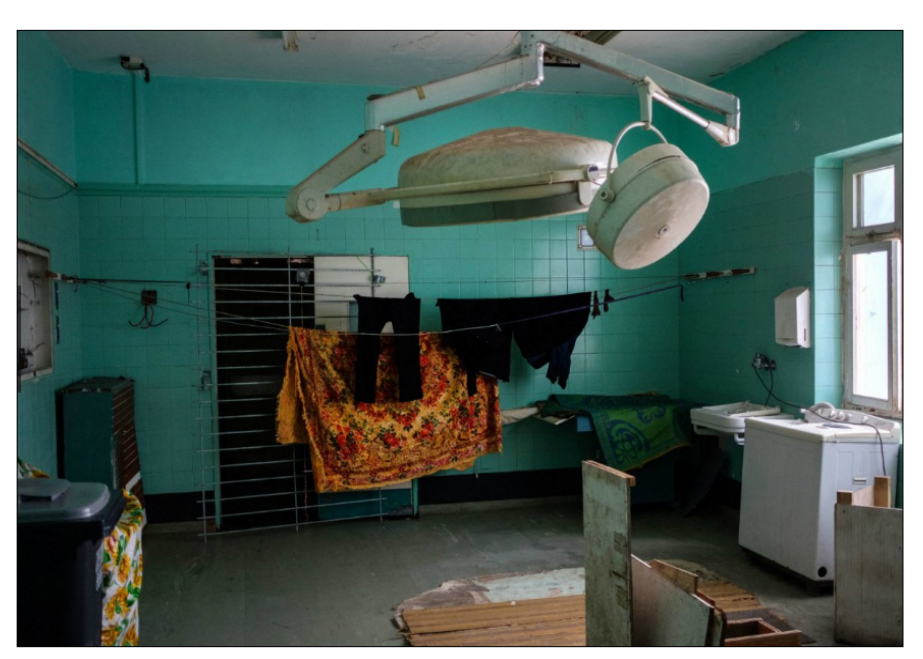
Figure 2: A room in the Cissie Gool House

These cases depict how degrading and dehumanising evictions that discard the urban poor are pursued in the name of making cities attractive for reinvestment and redevelopment. Madlingozi (2017) identifies how the South African Constitution has enabled and entrenched the motives of apartheid segregation and refers to what De Sousa Santos (2007: 3) terms the "abyssal line", the line dividing the colonial worlds of the haves and the have nots, where the White population is viewed as superior and more worthy than the Black population. Inevitably, this line means that urban redevelopment policies would not serve the urban poor; rather, they seek to perpetuate the exclusionary