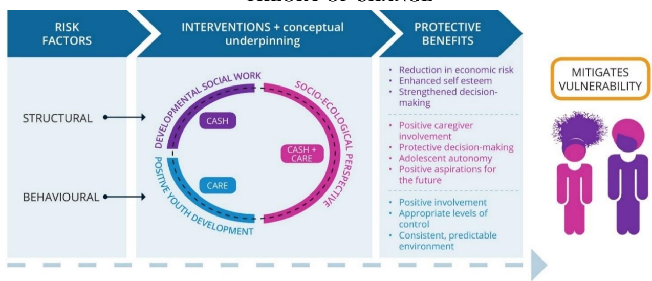
FIGURE 2 THEORY OF CHANGE

The findings illuminated various environmental factors that impact either positively or negatively on caregiving.