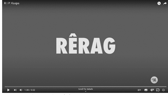
Figure 1. Kaaps linguistic features in Vannie Kaap's (2019) video

Vannie Kaap's video shows how speakers, as agents, reflexively employ linguistic forms to produce and reproduce contextualised social structures. Reflexivity (as used here) refers to the states of "agentive consciousness" of people acting in social situations, "so that language use is appropriate to particular contextual conditions and effective in bringing about contextual conditions"; that is, reflexivity is part of speakers' metapragmatic awareness (Silverstein, 2006: 462-463). Metapragmatic awareness is a speaker's ability to recognise the usual or expected context for the use of certain linguistic expressions; this awareness is tied to certain properties of the linguistic forms (e.g. as markers of identity) that presuppose or entail contexts-of-use (Silverstein, 1981, 1993). Presupposition, in Silverstein's definition, is "appropriateness-to-context", where the meaning of the linguistic form as index is "already established between interacting sign-users", albeit implicitly (Silverstein, 2003: 195). With entailment, a sign's "effectiveness-in-context" is brought into being (i.e. created) by the usage of the indexical sign. Presupposition therefore works on the existing association of the indexical linguistic form to context-of-use, while with entailment, the language user creates a new context-of-use (Silverstein, 2003: 195; also see Eckert, 2008).