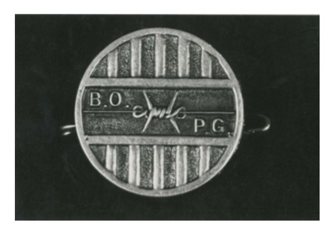
Figure 1: The BOPG badge. 222

Regarding the need for a badge, one of the main requirements for the design was that it had to include themes directly related to the internment camps and prisons. One suggestion was that the coat of arms had to depict 'the barbed wire of the camps in the middle and the bars of the prisons on either side'. <sup>219</sup> This emphasis on themes directly relating to internment and internment camps shows that the BOPG members perceived their shared experience as internees and political prisoners as the basis on which this new community rested and was formed. This is proved even further by the decision made by the BOPG to limit the number of badges that were physically produced, and by issuing them only to a 'limited number of persons'. <sup>220</sup> This move not only formed a community but also added to the perceived prestige of belonging to the BOPG. The final coat of arms was approved at the BOPG conference on 4 October 1947 (see Figure 1). <sup>221</sup>