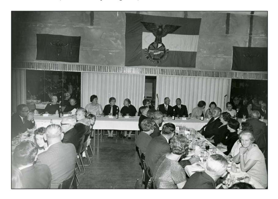
Figure 4: A scene at a BOPG dinner in 1969 with the OB coat of arms and flag in the background. ^{275}

hosted by the BOPG, OB symbols and icons were visible and formed an essential part of the social event (see, for example, Figure 4).