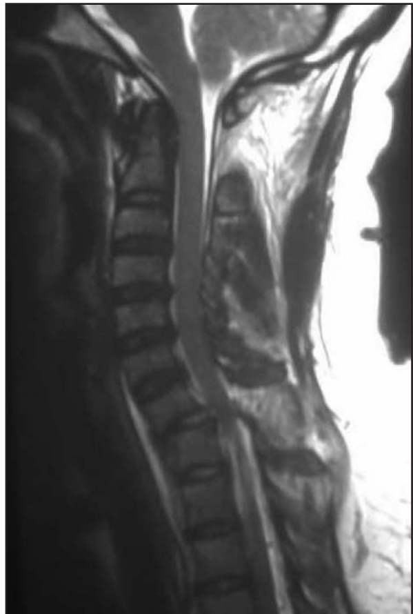
Figure 3. Pre-operative MRI of the C7/T1 trauma

In our case the loss of CSF resulted in the caudal migration of the brainstem, traction on the abducens and the resultant palsy. Care should be taken in such a case of a large CSF leak, possibly stemming the intra-operative loss with patties and dura repair if possible.