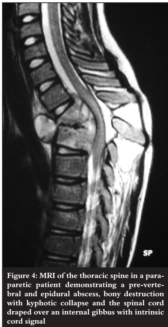
Figure 4: MRI of the thoracic spine in a paraparetic patient demonstrating a pre-vertebral and epidural abscess, bony destruction with kyphotic collapse and the spinal cord draped over an internal gibbus with intrinsic cord signal

This technology has largely been superseded by MRI, but with access problems in some hospitals, bone scan may still have a role. Unfortunately it does not delineate the soft tissue extent of the disease.