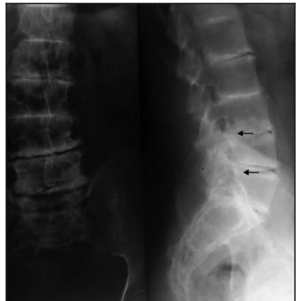
Figure 2. Calcification of the inter-vertebral discs (see arrows)

Ochronosis is a very rare autosomal-recessive disorder of metabolism. It results from a deficiency of the enzyme HGA oxidase, which is involved in the degradation of tyrosine. This results in accumulation of HGA and its degradation products in the tissues. It occurs worldwide but the prevalence is lower than 1:250 000 in most populations. 2