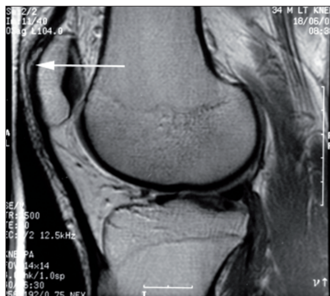
Fig. 2. Same sequence scan of the same knee as in Fig. 1, 48 hours post-race. Increase of signal intensity in distal quadriceps tendon (white arrow) indicates overuse.

The total score for all knee lesions in each runner on the pre-race scan was a mean of 2.1 (standard deviation (SD) 1.197); the immediate post-race scan score was 3.2 (SD 1.317), and