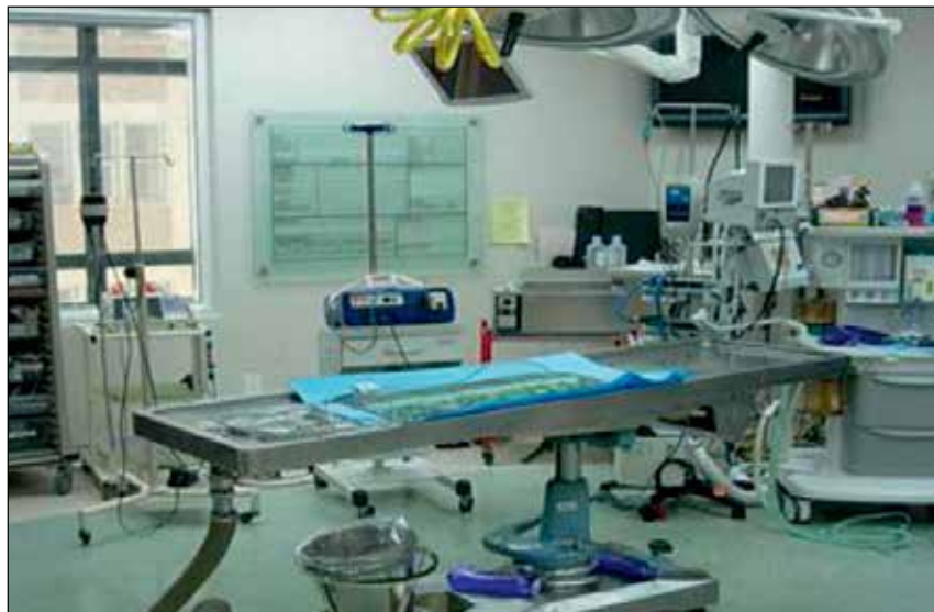
Fig. 3. A modern and well-equipped theatre. Note the specialised operating table and the electrocautery mattress.

We are fortunate to have a dedicated burns theatre with the required facilities for heating, correct anaesthetic equipment, specially designed operating table and appropriate consumables (Fig. 3).