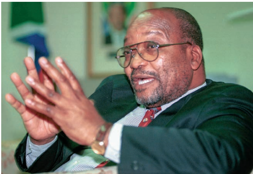
President Jacob Zuma.

Meanwhile healthcare bodies are attending a flurry of NDoH 'stakeholder consultation' workshops aimed at penning regulations to mitigate the sweeping new legal provisions – while consulting lawyers to protect their rights. Failure to comply with the new law is punishable by a fine, 5 years' imprisonment, or both. The three doctor bodies, the South African Medical Association (SAMA), the South African Dental Association (SADA), and the SA Private Practitioners Forum (SAPPF) (specialists), agree with the noble intentions of the law, but see it as a blunt and coercive instrument that will have grave unintended consequences.