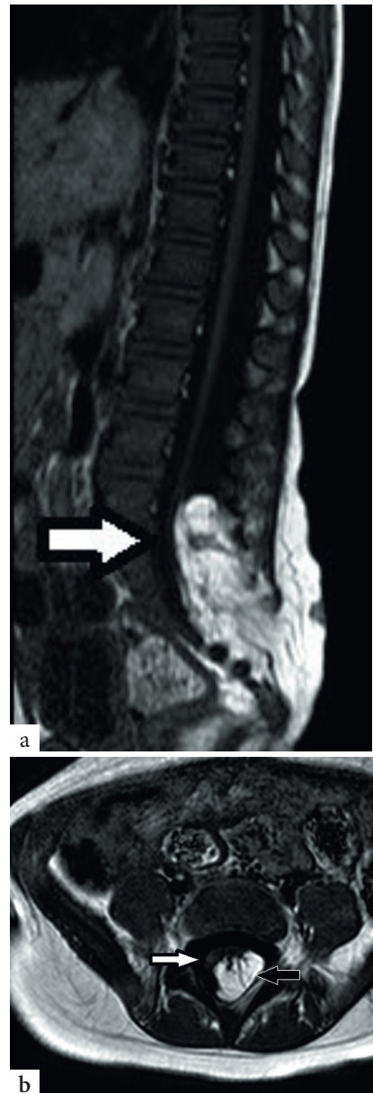
Fig. 3. T1-weighted magnetic resonance imaging scan of the spine, demonstrating a transitional lipoma attached broadly to the distal spinal cord in the sagittal (a) and axial (b) planes (the white arrow shows the compressed and distorted spinal cord, and the black arrow the large lipoma within the dural sac and attached to the cord).