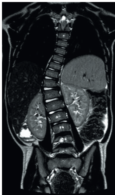
Fig. 6. Coronal magnetic resonance imaging scan of the spine showing scoliosis associated with a tethered cord.

Approximately 50 - 70% of patients with OSD will have some form of orthopaedic deformity, including limb length discrepancy, unilateral atrophy, scoliosis (Fig. 6) and