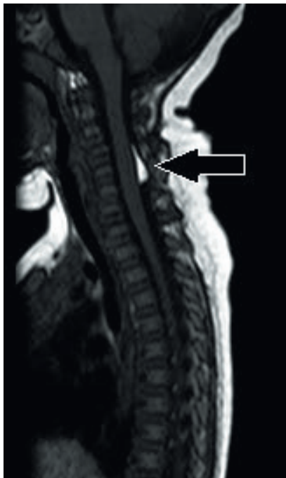
Fig. 5. Magnetic resonance imaging scan of the spine showing an intradural lipoma in the cervical region (arrowed). Although the vast majority of occult spinal dysraphism lesions are in the lumbar and sacral regions, they may occasionally occur in the thoracic and cervical spine.

has two or more lesions. [6] The lesions are usually located in the midline lumbar region; occasionally they may be off-centre or further rostral along the spine (Fig. 5). Table 2 lists some of the abnormalities that may be noted, although any cutaneous lesion along the spine should raise concern about OSD.