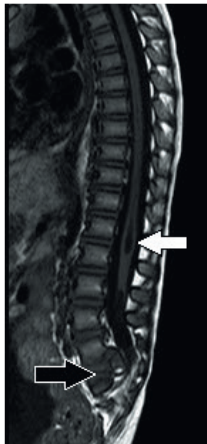
Fig. 2. Sagittal magnetic resonance imaging scan showing caudal regression. Note the abnormal development of the bony sacrum (black arrow) and the spinal cord conus. There are also fluid-filled cavities in the cord (syringomyelia, white arrow).