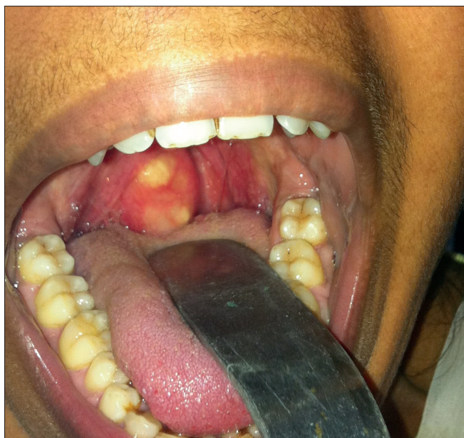
Fig. 1. Pre-operative photograph of the patient's throat.

A lateral radiograph of the soft tissue of the neck showed a large soft-tissue shadow in the prevertebral space. On plain and contrast computed tomography (CT) scans (Figs 2 and 3) an abnormal well-defined hypodense necrotic lesion from C1 to C4 measuring 4.5×2.5×2.0 cm was seen. There was minimal peripheral rim enhancement in the right lateral wall of the nasopharynx and the posterior wall of the nasopharynx, oropharynx and laryngopharynx, and the appearance was suggestive of an abscess. The lesion extended cranially up to the nasopharyngeal isthmus and the nasopharyngeal roof and involved the right tonsillar fossa, compressing and effacing the right fossa of Rosenmüller, occluding the right eustachian tube opening, and compressing and displacing the right lateral and posterolateral walls of the nasopharynx and laryngopharynx with moderate luminal compromise of the nasopharyngeal airway. No underlying bony erosion was seen. Enzyme-linked immunosorbent assay for HIV was negative.