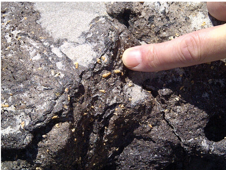
Figure 5: Mid-Holocene, dark muddy sediment containing abundant shells of the hypersaline terrestrial mollusc Tomichia ventricosa , exposed on 16 Mile Beach in February 2017 (sampling location YZF23).

immediately north of Yzerfontein (Figure 1); the evidence for an interplay between littoral dunes and saline pan features; and the presence of coeval storm beaches on the rocky promontories.