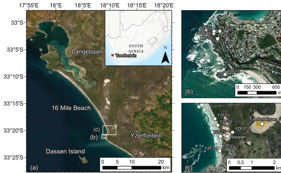
Figure 1: Map insert and aerial photographs showing the location of Yzerfontein in South Africa and the sampling locations of molluscs for radiocarbon dating.