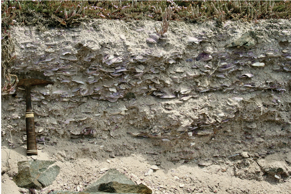
Figure 6: Eroded face of the Late Holocene storm beach at 2–3 masl on Schaapen Island (sampling location YZF12).

The gypsum deposits in both pans result from multiple, successive marine inundations over a coastal bar, followed by evaporation to a brine at least 3.35 times the salinity of sea water, to initiate precipitation of gypsum. 13 The succession of a marine embayment, followed by a pan with deposition behind an overwash bar, implies a falling sea-level, possibly linked to the waning Eemian interglacial. The Late Pleistocene beach deposit at 3 masl, preserved in the dune between the two pans, shows that Rooipan must be somewhat younger than Yzerfonteinpan, but that it developed under the same regime of intermittent inundation and evaporation of sea water behind an overwash bar somewhat further west. With a falling Late Pleistocene sea level, marine overwash ceased, and this bar too eventually was stranded. The cessation of marine overwash and gypsum deposition in both Yzerfonteinpan and the ancestral Rooipan was followed by seasonal inundation by terrestrial runoff, and the deposition of the fine muddy layers inhabited by Tomichia ventricosa .