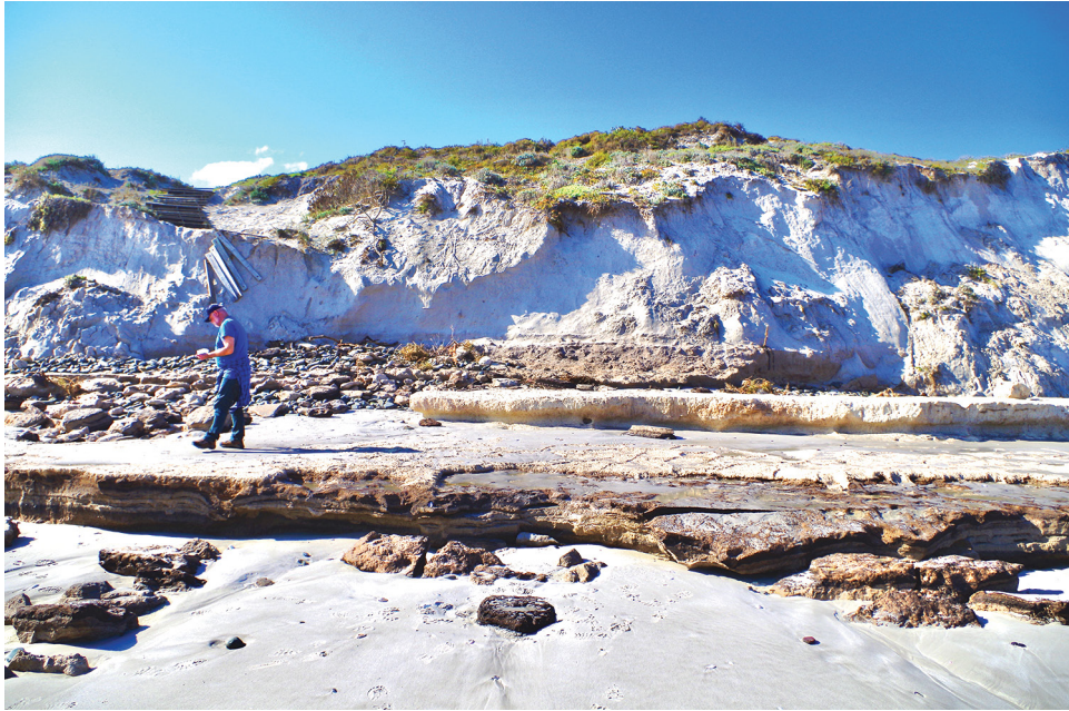
Figure 3: Mid-Holocene, dark organic mud horizons exposed temporarily in June 2017 by storm erosion of the beach deposits and the coastal dune at the southern end of 16 Mile Beach, Yzerfontein; capped by a yellow layer with polygonal desiccation cracks, on which the man is standing; overlain by two layers of semi-consolidated marine sand, with modern beach cobbles; in turn overlain by aeolian dune sand.

of Rooipan se Klippe yielded 50\,500 \pm 3400 (iT-C-2133). These dates are considered to be a minimum age estimate as shell assimilates post-depositional carbon over long periods 12 , and after calibration these are interpreted as >40\,700 cal BP and >50\,000 cal BP, respectively. They probably represent the Late Pleistocene (Eemian) Velddrif Formation. 13,14