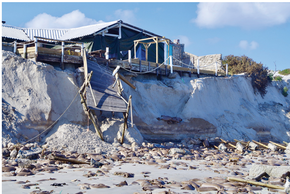
Figure 2: Photograph taken on 27 June 2017 of the Strandkombuis restaurant on 16 Mile Beach at Yzerfontein, showing collapse due to cumulative storm damage earlier that month.

At each sampling location the elevation was measured using a Hemisphere S320 GNSS system. The transmitter was mounted on a measured pole and held in place until it received signals from a minimum of 50 satellites. Depending on the sites measured, the resolution ranged from 0.5 cm to 30 cm in the X, Y and Z dimensions. Elevation values reported are reduced relative to mean sea level.