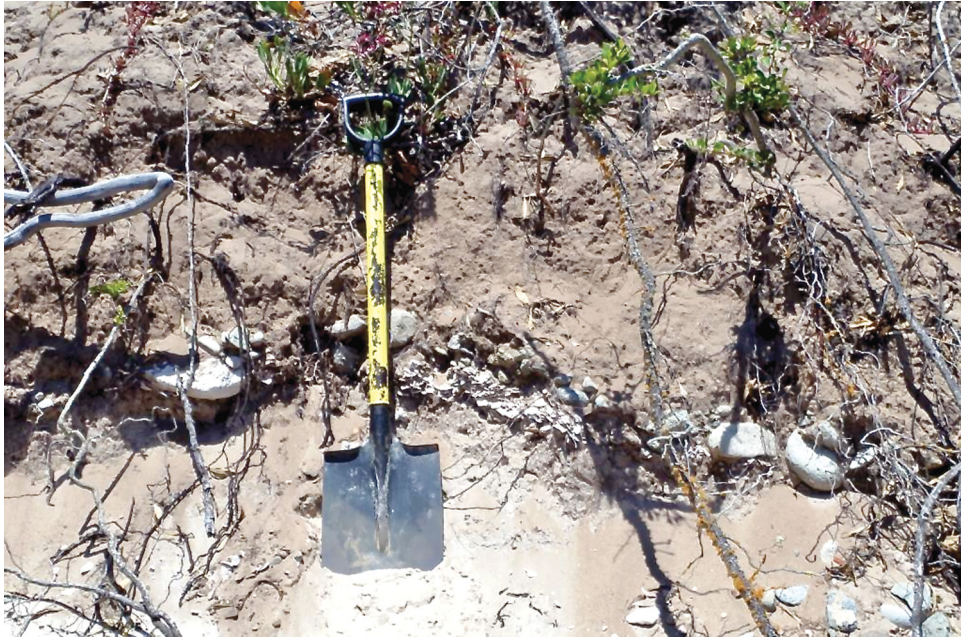
Figure 4: Layer of Late Pleistocene marine shells and rounded beach cobbles at 3 masl above clean white sand and below the brown soil horizon, exposed in a borrow pit in the dune on the inner margin of Rooipan (sampling location YZF07).