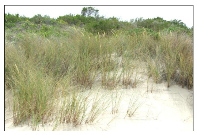
Figure 2: Ammophila arenaria (marram grass) at Oyster Bay being replaced by shrubs with coastal scrub in the distance.

in numerous regions, sometimes over >100 ha in extent, by the then Department of Forestry as part of an extensive stabilisation programme of mobile dune systems.<sup>8</sup> These stabilisation programmes were often inappropriate as dune studies at Rhodes University and the Coastal Research Unit at Nelson Mandela University only later showed. At this time, Roy Lubke and Ted Avis published their illustrated pamphlet.<sup>1</sup>