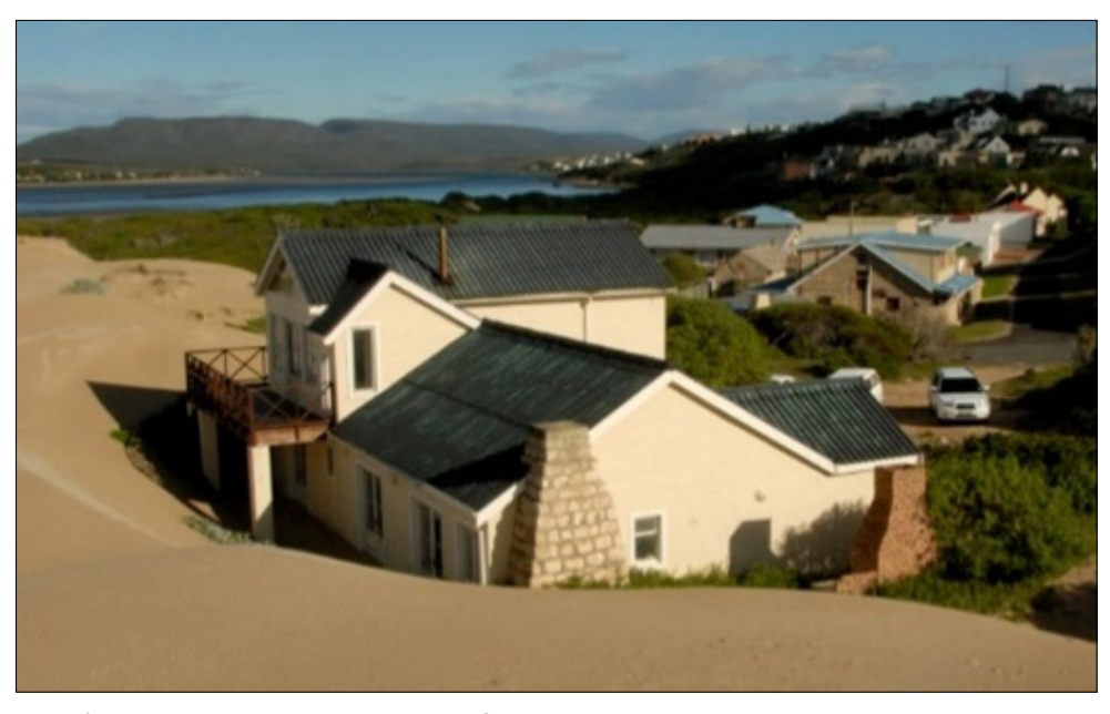
Figure 1: A property at Witsand on the southern Cape coast.

Imagine having purchased a beach house along the Cape coast on a fine summer day to spend family holidays relaxing and enjoying South Africa's marvellous coastal environment. Then, on a visit to the beach house in the winter, when a strong southeasterly wind is blowing, you find that the dunes that naturally migrate along the shore are approaching your house at a rapid rate. When you approach a local environmental consultant, they assure you that, with permission from the authorities, you can stabilise the dune system and divert those sands away from your property.