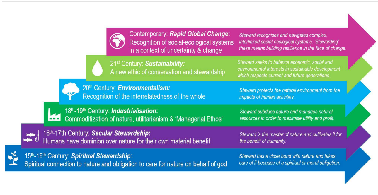
Figure 1: The changing meanings of environmental stewardship in Western history (adapted from Worrell and Appleby 5 , Berry 11 and McArthur 12 ).

the sustainability sciences and social-ecological systems fields 3,4,9,21 , despite widely debated critiques of the concept 11,14,17 .