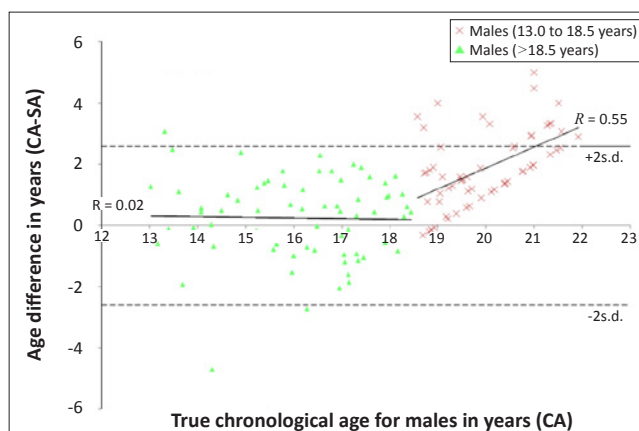
FIGURE 2: Scatter plot illustrating the difference between true chronological age (CA) and skeletal age (SA). The trend lines depict how the two variables are related between 13 years and 18.5 years ( R = 0.02 ) and between 18.5 years and 21 years ( R = 0.55 ). The division between the two age groups illustrates the vast increase in the difference between chronological age and skeletal age after the chronological age of 18 years. The majority of the points lie above the y = 0 line, indicating that skeletal age is lower than chronological age. Outliers are points located outside two standard deviations ( \pm 2s.d. ), indicated by the dashed lines.