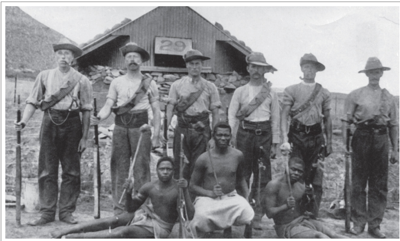
'Colonial troops and African auxiliaries at a blockhouse.'

if the questions are too hard to answer, the temptation is for politicians to forget about the past completely or to get it spectacularly wrong in the name of inclusive nation building.