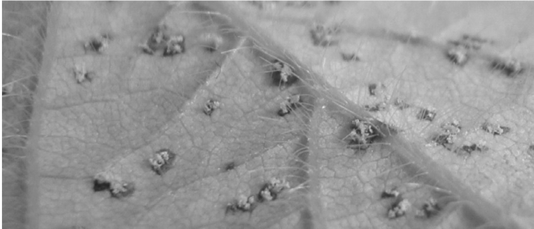
Fig. 1. Tan sporulation of soybean rust on the lower leaf surface of a susceptible soybean genotype.

with bacterial pustule disease [ Xanthomonas campestris pv glycines (Nakano) Dye]. 22 Soybean rust symptoms generally occur first on the leaves at the base of the plant and progress up the canopy as the disease severity increases. Increased lesion density leads to leaf yellowing and ultimately premature leaf senescence, resulting in yield losses primarily through reduced grain size. 23