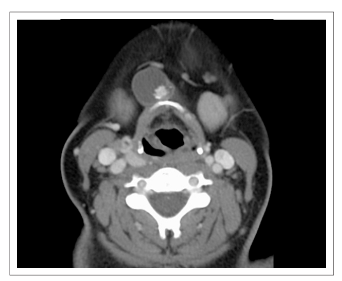
FIGURE 2: Axial CT scan image at level of hyoid bone.