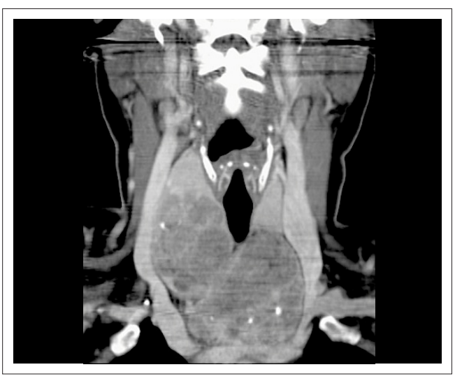
FIGURE 4: Coronal CT scan image of anterior neck triangles.