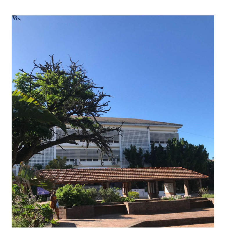
Photo 5: Intellectual torment – UFH female participant, February 2020

spaces. This awareness and a commitment to change served as the motivation for many students in our study. With the picture from the UFH in Photo 5, a participant sought to illustrate how the need for change set the stage for her purpose-driven behaviours to see transformation happen in the university.