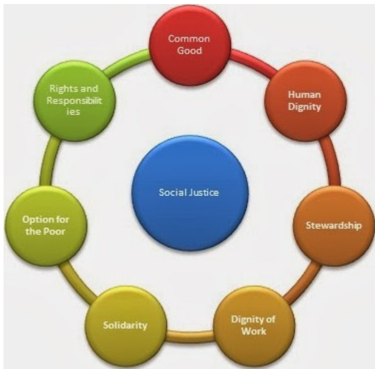
Figure 1: Social justice

Social transformation can only be achieved through the adoption of an integral approach involving both the staff and students like the 3D Pedagogy Framework, a tripartite model that advances cultural democracy, diversification of content, teaching styles and teaching personnel. In common with diversity, decolonisation is inconsequential unless it forms part of an institution wide programme of strategic matters delivering infrastructural changes to educational and academic practice that include policy reform and accountability at all levels of the institution. These critical interventions are critical to disrupt dominant norms that privilege White, European identity and perpetuate racial inequality in higher education (Hargreaves 1988, 37).