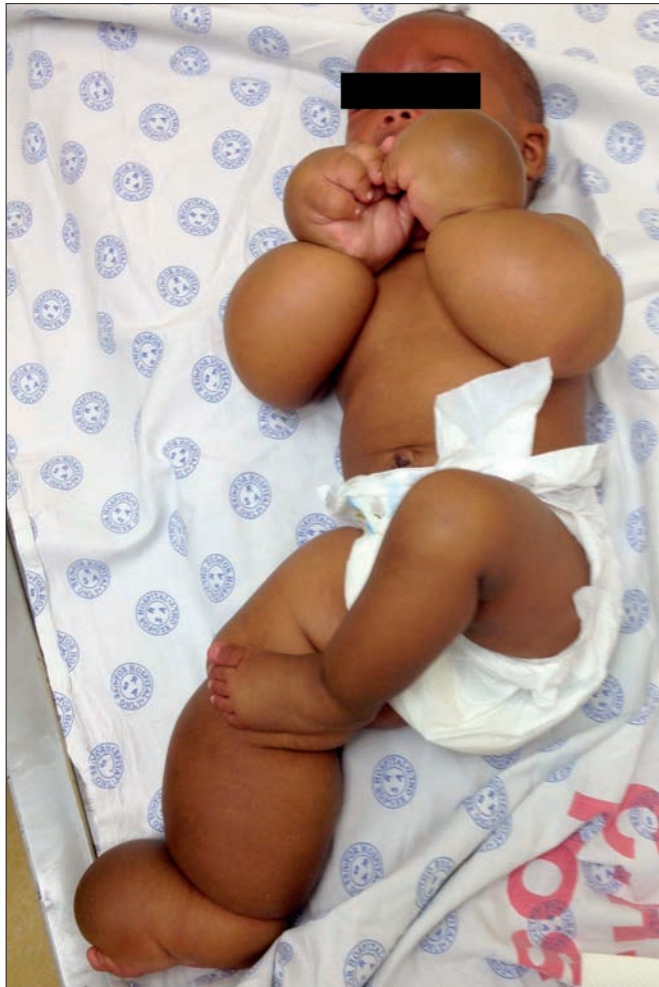
Fig. 1. Infant with lymphoedema of both upper limbs and right lower limb (reproduced with permission from the parents).