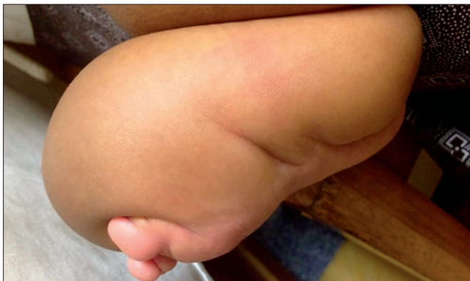
Fig. 2. Right foot, showing typical dorsal oedema (reproduced with permission from the parents).

Milroy disease is a congenital form of primary lymphoedema. It is an autosomal dominant condition inherited with variable expression and