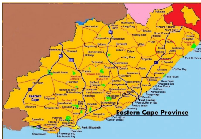
Fig. 2. Geographical distribution showing clustering of cases in the Eastern Cape Province (red circle).

In a Turkish report of 100 pulmonary hydatidosis cases, the largest group comprised of school-aged children aged 3 - 9 years. [2] In our study, the age distribution was comparable. In another Turkish study, the children were found to be older, with a mean age of 10.2 (3.9) years. [14] The number of males with hydatid cysts exceeded that of females at a ratio of 6:1. This male predominance has been noted in previous studies. [11,15-17] In one study, the male prevalence was 76%. [15] This may be related to traditional practices wherein the rearing of livestock is left to males, especially young boys. The risk factors for hydatid disease are well known, and include exposure to animals such as dogs, sheep, cats and cattle. In the current study the subjects reported exposure mainly to dogs, sheep and cattle.