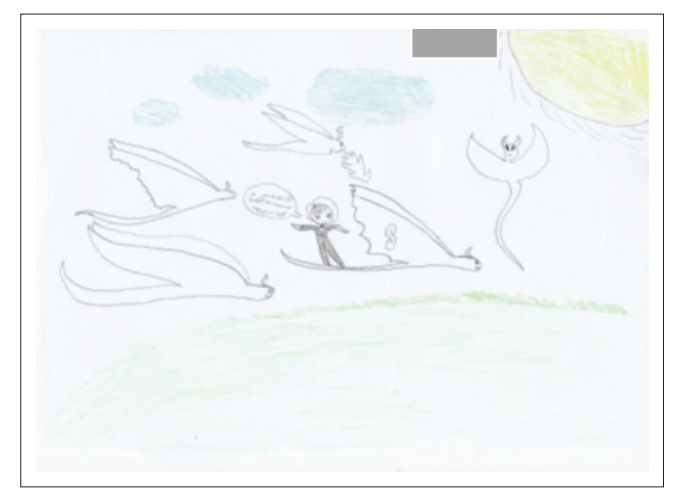
FIGURE 4: Fantasy dragon sky.