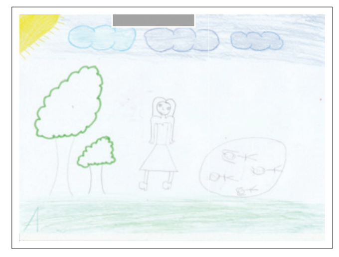
FIGURE 3: The dragon as human.