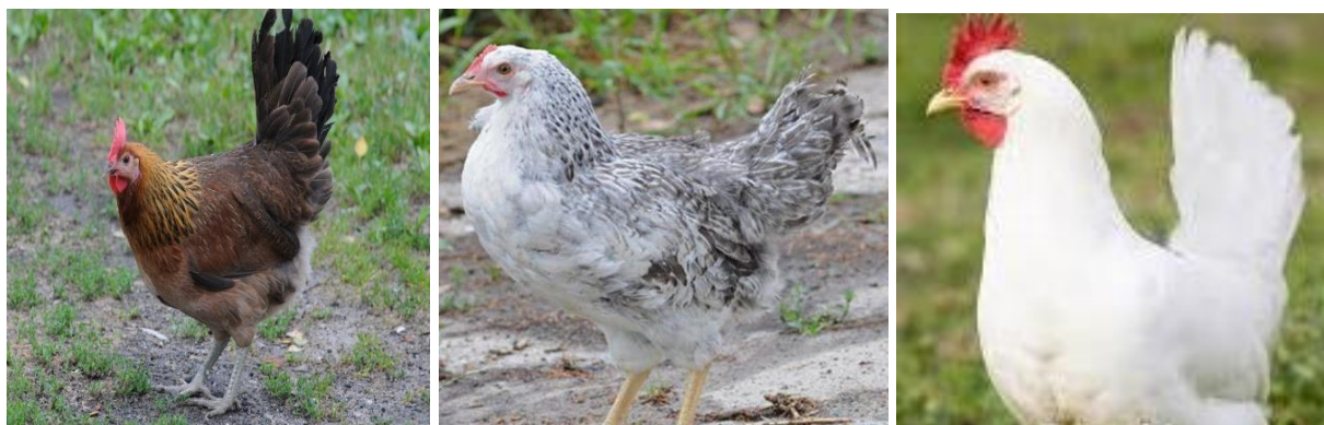
Figure 1 Representative images of the Green-legged partridge, Polbar, and Leghorn laying hens

This research was conducted on three breeds of laying hens, namely Green-legged partridge (Zk), Polbar (Pb), and Leghorn (Lg) (Figure 1). These breeds had been the subject of earlier research (Kozak et al. , 2019a). Green-legged partridge is a native Polish breed that is often found on organic farms. These hens are well adapted to the conditions of extensive free-range farming. Polbar was created by mating Green-legged partridge hens with Plymouth Rock cocks. The breed features of Pb chickens became fixed in the 1950s. Both breeds (Zk and Pb) are kept in closed populations that do not undergo selection, as they are included in a genetic resource's conservation programme. Leghorn, which is one of the most popular layer hen breeds, is especially adapted to intensive breeding and is subjected to intensive selection. The research material consisted of 150 laying hens, including 50 Zk, 50 Pb and 50 Lg. All birds came from the same brood and were 33 weeks old at the time of the behavioural study. All breeds were kept in one building to ensure uniform environmental conditions, in six separate pens on litter, each with 25 hens of one breed. Each pen had a density of 0.3 m 2 /individual bird (Journal of Laws, 2003).