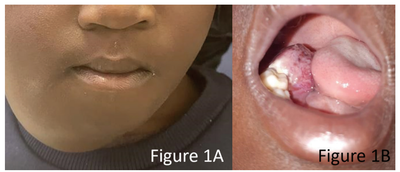
Figure 1: (A) Clinical photograph of the patient showing facial swelling and asymmetry on the right. (B) Intra-oral photograph of the patient showing a papillary, expansile lesion in the region of the 46 causing displacement of the tongue.

A four-year-old African male patient presented to our clinic with a two-month history of a firm, warm lesion involving the right side of his face. The lesion presented as a bleeding papillary mass in the 85/46 region that extended to the floor of the mouth, causing displacement of the tongue (Figure 1A-B). Upon cone-beam computed tomography (CBCT) examination, an expansile homogenous intermediate density lesion was noted with complete destruction of the bucco-lingual cortical bone. Discernible extensions were identified in the anteroposterior plane from the region of the 84 to the posterior mandible involving the right corpus, developing 46, angle and ramus but spared the condyle and coronoid processes. The lesion extended inferiorly below the epiglottis and showed a reduction of the hypopharynx. Marked bucco-lingual expansion with soft tissue swelling was noted (Figure 2A-D). An incisional biopsy was performed under general anaesthesia, and histological examination rendered a diagnosis of desmoplastic fibroma (DF).