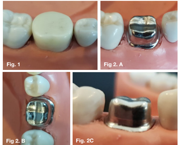
Figure 1. A milled crown with a flat occlusal surface.

Each crown was then seated on the metal replicated tooth set in a typodont model with adjacent teeth to provide contact points. The typodont model was set on a custom-made tilting device (adapted from the model-