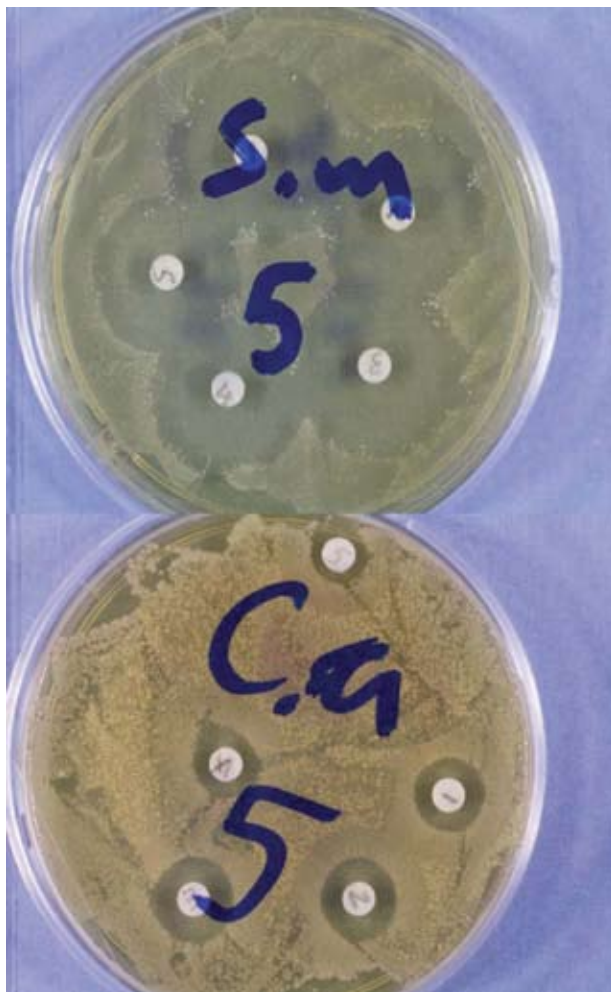
Figure 1: Typical agar plates showing S. mutans and C. albicans growth colonies (above and below respectively). BHI agar plate Number 5 (of 14) showing inhibition zones around different CHX preparations. Numbers on filter papers denotes the following: 1: CHX1 (only CHX 0.2%), 2: CHX2 (only CHX 0.12%), 3: CHX3 (Corsodyl® - 0.2% CHX), 4: CHX4 (Curasept® - 0.12%CHX) and 5: CHX5 (GUM® Paroex® - 0.12% CHX)

The mean diameters and standard deviations of the corresponding inhibition zones were calculated and compared using the analysis of variance (ANOVA) test. A P value of less than 0.05% was considered statistically significant.