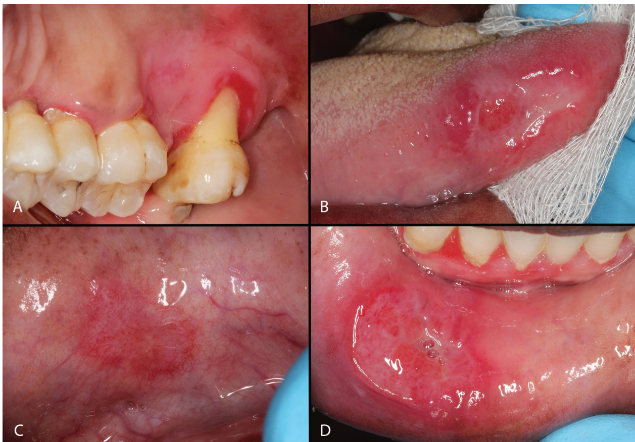
Figure 2: Improvement of most of the lesions after one month.