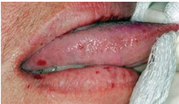
Figure 2: The vermilion areas of the lips are commonly affected. Dilated vessels are also present on the tongue..