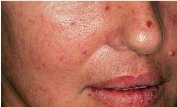
Figure 1: Numerous red macules on the face representing telangiectatic blood vessels.