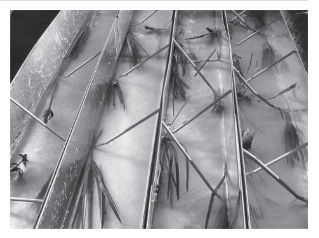
FIG. 3 Mortality curves for Simulium spp. based on applications of permethrin RD95B at different concentrations, for gutter and river trials

effective concentrations of permethrin (Fig. 3). Similar findings were made in West Africa, and the researcher recommended the use of a closed-circuit trough system for screening conventional larvicides for blackfly control (Ocran 1989).