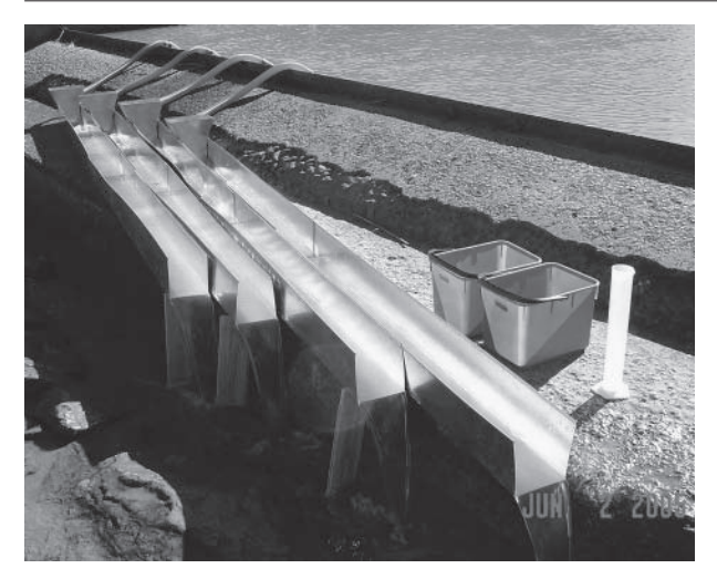
FIG. 2 Flow-through gutter system used for larvicide trials on S. chutteri larvae

before exposure to chemical larvicides, whereas for B.t.i. trials larvae were given an 1.5 h to settle. The only species of blackfly that was present was S. chutteri.