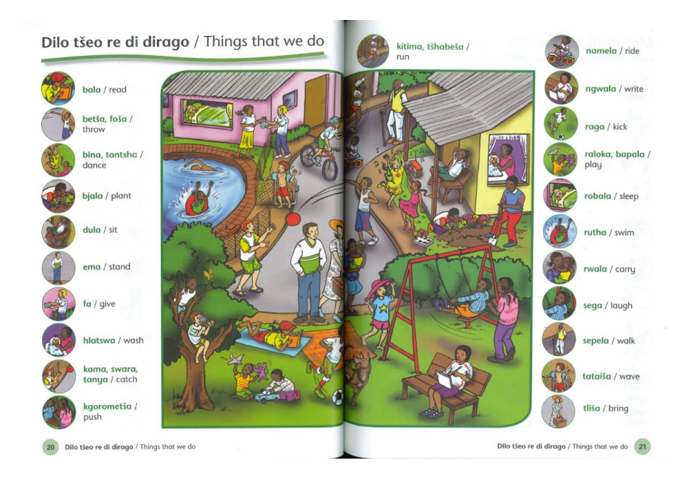
Figure 5: Theme page "Things that we do" in the 2010 Longman Foundation Phase Bilingual Sepedi–English Dictionary (Mabule 2010: 20-21)

portrayals of stereotypical ideals and ideologies about men and women in the English language textbooks can have lasting consequences. Children and adolescents usually develop their ideas about the world at an early stage and this will last well into their adult lives. The textbooks, by depicting gender bias ideologies, seem to suggest that women have a limited or restricted role to play in a male-dominant society and women, by accepting such a perspective, perceive this view as normal.