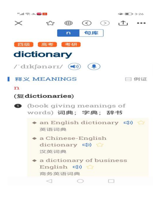
Screenshot 5: Information given by ECD