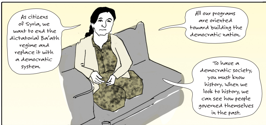
Figure 3: YPJ Academy, Hasakah, the election and education of women and men's defence force voluntary recruits, shared with permission of the author and publisher. 33