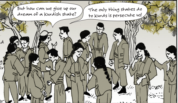
Figure 2: Abdullah Öcalan and Democratic Confederalism debated in PKK camps, shared with permission of the author and publisher. 15

The only thing states do to Kurds is persecute us!