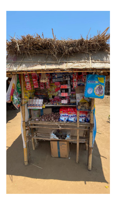
Figure 6: Business selling essential products mainly managed by people from fishing communities.

Through the implementation of a programme geared towards providing technical training and paid internships, young people from fishing communities are served by mobile training units. However, despite the implementation of training in areas such as carpentry, complaints and adaptation challenges persist. Generally, host communities complain about high labor costs and pay well below the market, alleging inexperience of these new service providers.