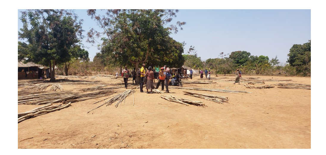
Figure 2: Local materials for construction of the first accommodation in the center of Marrupa-Chiure in September 2020 when the number of displaced people began to grow, and new districts began to welcome people.