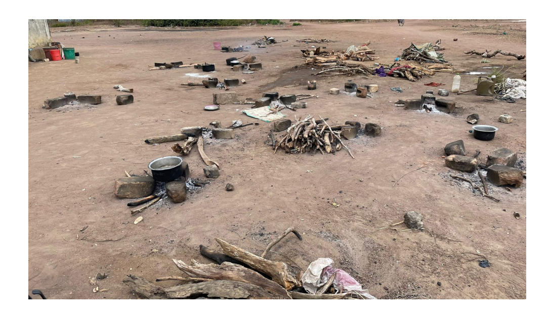
Figure 5: Displaced Persons Center with irregular food assistance in Balama.

The distribution of food is primarily undertaken by the WFP with the support of CSOs contracted for this process. However, the registration of beneficiaries, a key prerequisite for the distribution of food, is exclusively done by government authorities at the local level. Crucially, these often reflect patterns of corruption or patronage to benefit family members or other people based on ethnic and/or religious affinities, mainly in reception neighbourhoods and to a lesser extent in accommodation centres where people are registered based on time of arrival. Under these circumstances, food distribution and other support is somewhat biased despite local authorities insisting that there are absolutely no criteria based on origin in the distribution of support.