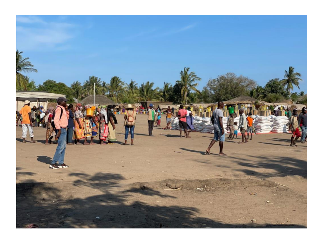
Figure 4: Distribution of food kits at a displacement centre in Metuge District, October 2021, Cabo Delgado Province.

in these centres where people from different contexts are practically forced to share space despite their differences.