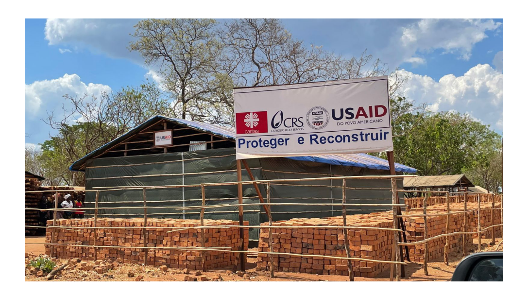
Figure 3: Visual representation of a reception centre in Chiure with identification of some of the international organisations that support it.

In sum, we argue, these features are salient not only throughout Cabo Delgado but not least in the centres for the displaced and may go some way to explaining the moderate levels of resilience to violent extremism manifested in the poor connectedness between the communities in the origin areas and in the displaced centres. Further, the dynamics presented above are consistent with the general development