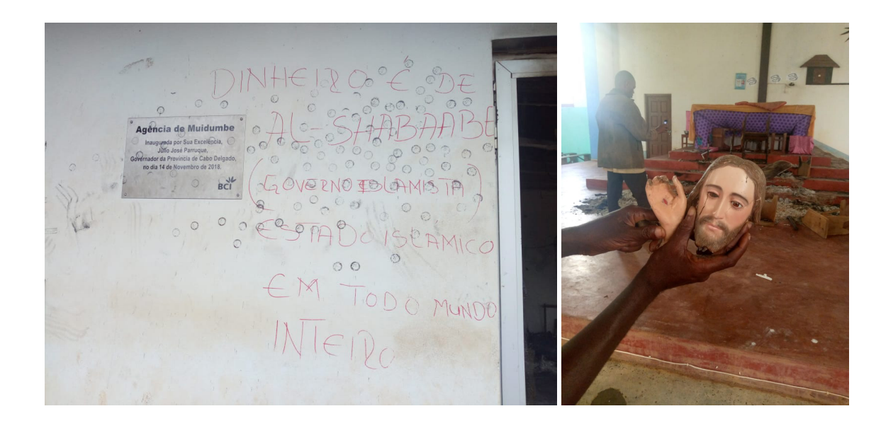
Figure 2 [left]: An insurgent graffiti near an ATM in Namakande, Muidumbe (unknown author, first circulated on Pinnacle News).

Figure 3 [right]: A broken statue, in the aftermath of the vandalisation of the Church of Sacred Heart of Nangololo, Mwambula, Muidumbe (unknown author, first circulated on Pinnacle News)