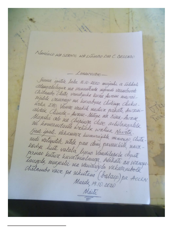
Figure 4: A communiqué celebrating the victory at Awashi, in Shimakonde (unknown author)