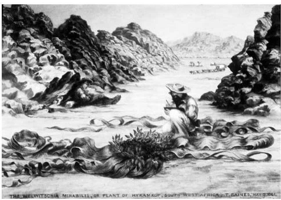
Figure 1: Thomas Baines, Welwitschia mirabilis, 1861, oil on canvas, Royal Botanical Gardens, Kew

Interestingly, his account of the extraordinary plant includes an image of himself drawing it and the wagon train in the background of the picture, as if the artist is indicating the distance he had to travel to discover the plant and confirmation that it does indeed look as he has represented it. Here and elsewhere, it seems that Baines was prompted by the transparency of photography to use artistic devices not available to the camera to assert the truthfulness of his rendering. Occasionally, however, painting might still have an advantage over photography, as when Baines would also draw on certain scientific conventions of representation that were beyond the powers of the camera. Thus he made botanical illustrations that included analytical images, for example cross sections, or images of the plant at different stages in its growth.