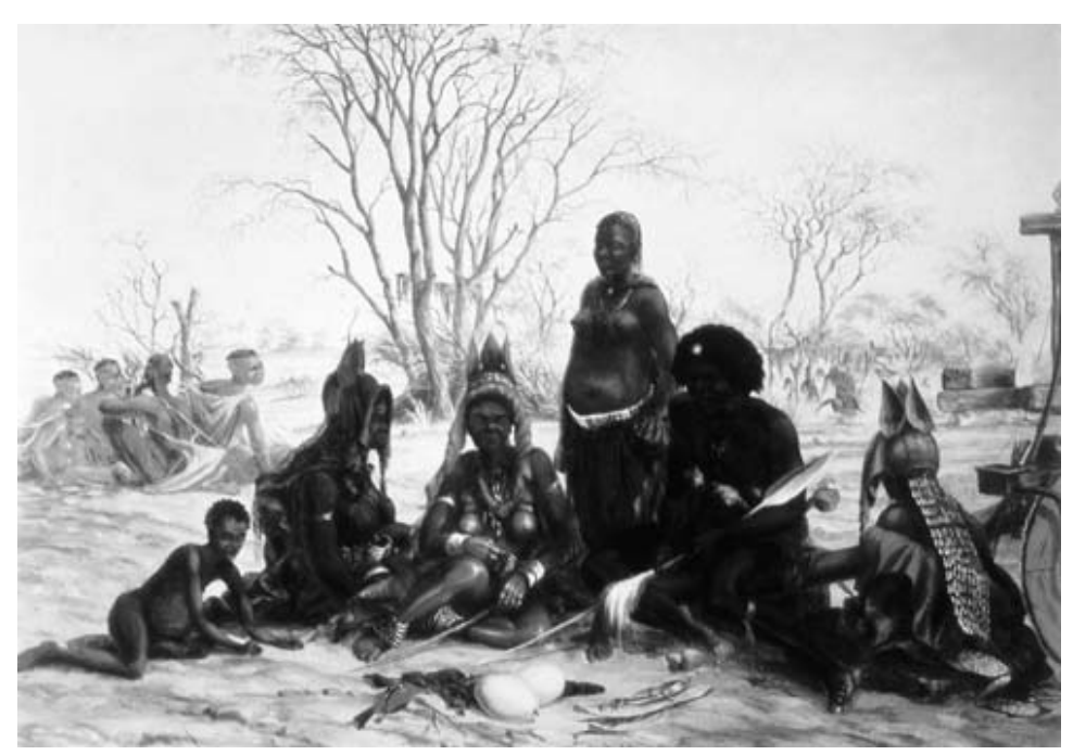
Figure 5: Thomas Baines, A Damara Family, 1861, oil on canvas, MuseumAfrica, Johannesburg, B248

on, and the distinctive characteristics between them and the group of Bushmen pointed out; the dead bird was called by its name, and, what I hardly expected, even the bit of wheel and fore part of the wagon were no difficulty to them. They enjoyed the sketch of Koobie (their chief) greatly, and pointed out the figures in the groups of men, horses and oxen very readily.<sup>19</sup>