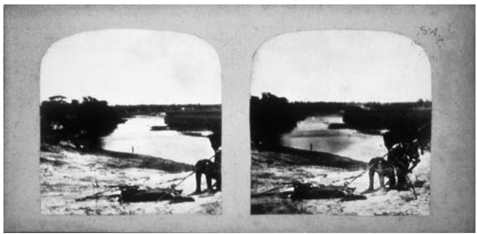
Figure 6: James Chapman, Botletle River, stereograph photograph, National Library of South Africa, Cape Town, INIL11075.