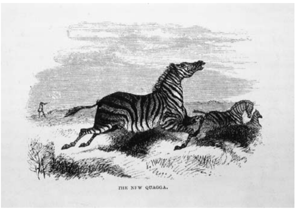
Figure 3: After Thomas Baines, The New Quagga, engraving from Thomas Baines, Explorations in South-West Africa (London, 1864)

own Explorations , although apparently in motion, has clearly been viewed from below, as if the animal were stretched out on the ground in front of the artist.