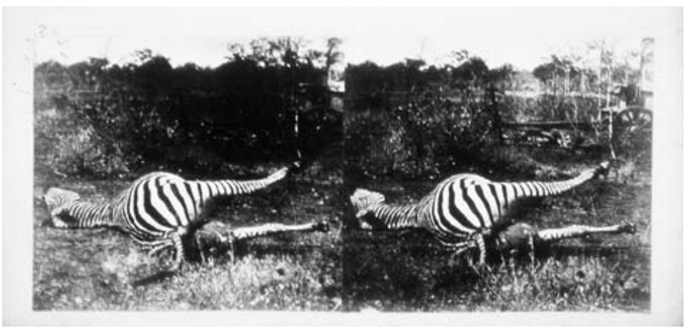
Figure 2: James Chapman, The Quagga, 1862, stereograph photograph, National Library of South Africa, Cape Town, INIL 11101

Baines acknowledged the supremacy of photographs for scientific purposes in a number of ways. Thus, he described his drawing of a dead gnu: