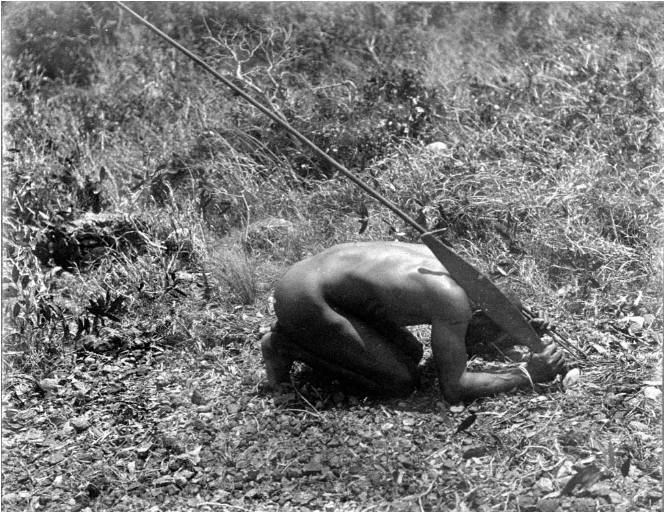
Figure 7. Re-enacting the death of Kwoiam, 1898. Photographer A.C. Haddon/A. Wilkin. (Courtesy of Cambridge University Museum of Archaeology and Anthropology T.Str. 66)

To conclude, it has been argued that theatre, like photography, is merely the reproductive slave of the ideological apparatus of reproduction which can only free itself by the notion of true performance . By using ideas of performativity, the heightening effect, in relation to photographs, one can, I would argue, do just this, bringing to the surface a grounded historical meaning which moves beyond the merely mimetic. I hope I have shown through this historiographical exploration certain relationships between photography and the performance of history in bringing the points of intersection and fracture to the fore. In this register the trivial the ordinary and unconsidered reveals, through the density of its multiple layers, the possibilities of the histories condensed within it.