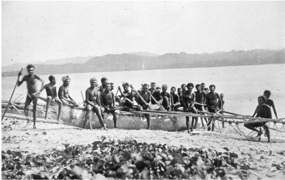
Figure 1. On the beach at Malekula, Vanuatu. 1884?