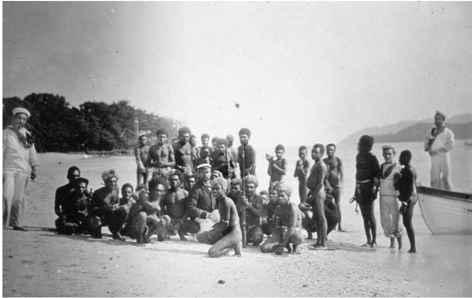
Figure 2. On the beach at Malekula. 1884?

I would argue that there are layered spatialities in this photograph, intensified by the framing of the photograph. A naval lieutenant is 'inserted' into the Melanesian physical space of the outrigger canoe. At one level the theatre of action on the beach would appear to fracture Melanesian space and make the colonial power relations visible, yet absence or silence can be a resonant active presence, a familiar device in both theatre and photography. Melanesian space may appear suppressed in the photographs, but it is present, embodied in Melanesian social being on their beach. Land is important in Melanesian societies, being linked to status through the production of food, but sea is equally so. One is a continuation of the other. Thus geographical 'facts' link people to their history and the organization of local knowledge and to Melanesian perceptions and definitions of space. 18 Malekulans, through presence of their own cultural understandings of that space, mark it within the photograph, if we, the viewers, only allow them that space. While this is intensified by the frame it cannot here necessarily be reduced solely to the action in the frame alone, but to the quiet assertions of intersecting histories which become more visible through the heightening action of the frame.