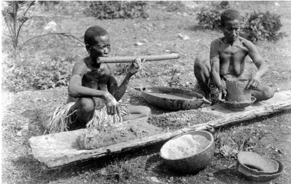
Figure 5-6. Demonstrating pottery making, Port Moresby. Photography A.C. Haddon/A. Wilkin 1898. (Courtesy of Cambridge University Museum of Archaeology and Anthropology Pap. C.D. 101-102)

I want now to look briefly at the performativity of the act of photographing. In many ways this is a less complex manifestation of the idea of performativity than those I have just considered. Nonetheless, it is one crucial to the relationship between photography and the making of history. We can see this operating through a very different and unremarkable set of photographs taken near Port Moresby, British New Guinea in 1898. They demonstrate again the way in which content can be understood to extend beyond its subject matter. In these photographs we can actually see the performance of making photographs - the photographs show us the act of observation.