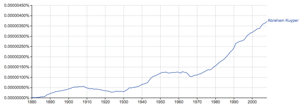
FIGURE 1. Graph of the number of works published in English that mention Kuyper. The y-axis percentage shows the books as a percentage of all books published.

As ever, the publication of works in English on Abraham Kuyper has not abated. The graph below – with data taken from Google books – shows increasing interest in Kuyper.