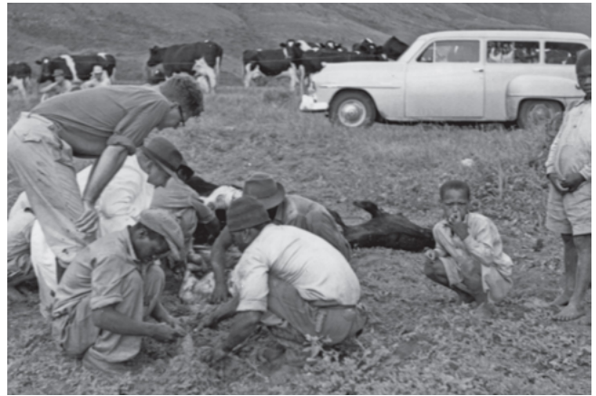
Figure 5: Typical working conditions on the rural farms