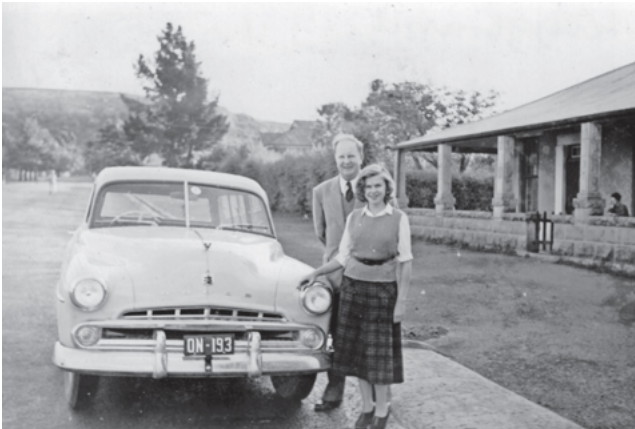
Figure 4: Mietek and Olénka in the 1950's