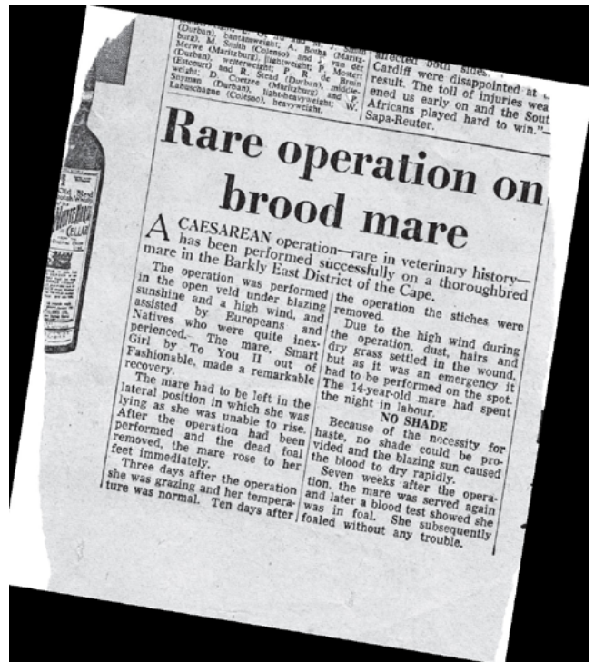
Figure 6: A newspaper article describing the event