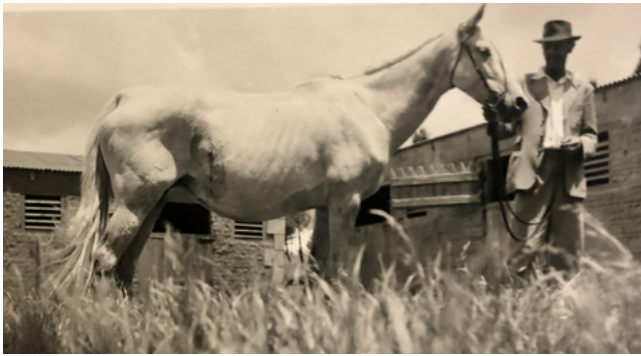
Figure 3: Smart girl