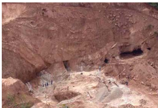
Figure 1—Typical example of artisanal mining in Central Africa