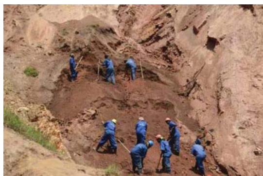
Figure 15—Artisanal miners utilizing appropriate PPE

income. Therefore, it is critical that mine operators realize the importance of safety and seeking to balance productivity with the need to improve working conditions. Standards must be relevant, and the introduction of safety measures should be seen as a process requiring buy-in from a number of stakeholders; starting with the miners themselves and including the mine owners if applicable, governmental agencies, the community, and mineral buyers. Appropriate minimum standards should be identified and progressive improvement in working standards established by all parties concerned. The implementation of mine health and safety standards should be viewed as a process with immediate, short-, medium-, and long-term goals.