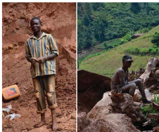
Figure 16—Artisanal miners