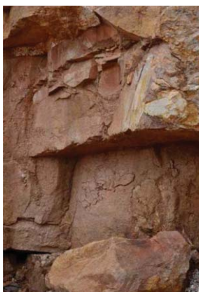
Figure 2—Rockfall in an artisanal open pit, Central Africa

Many accidents occur in artisanal mining. The five most frequently cited causes are as follows: