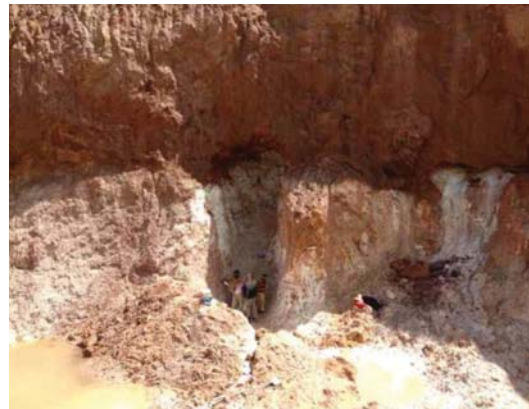
Figure 9—An example of creating a brow