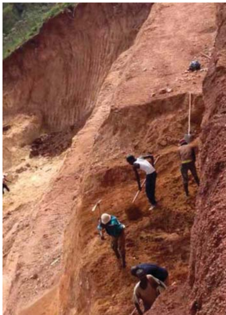
Figure 7—Mining activities on bench