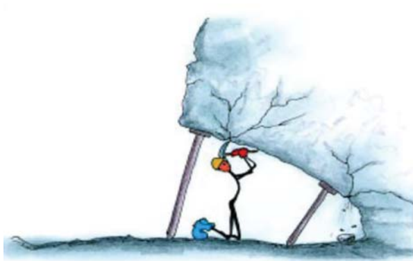
Figure 8—A schematic of unsafe mining under a brow (Walle and Jennings, 2001)