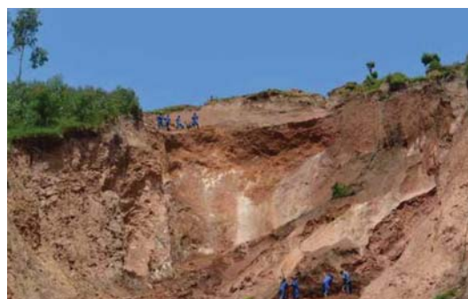
Figure 4—Mining close to edge of highwall