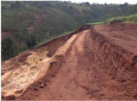
Figure 6—An example of benching