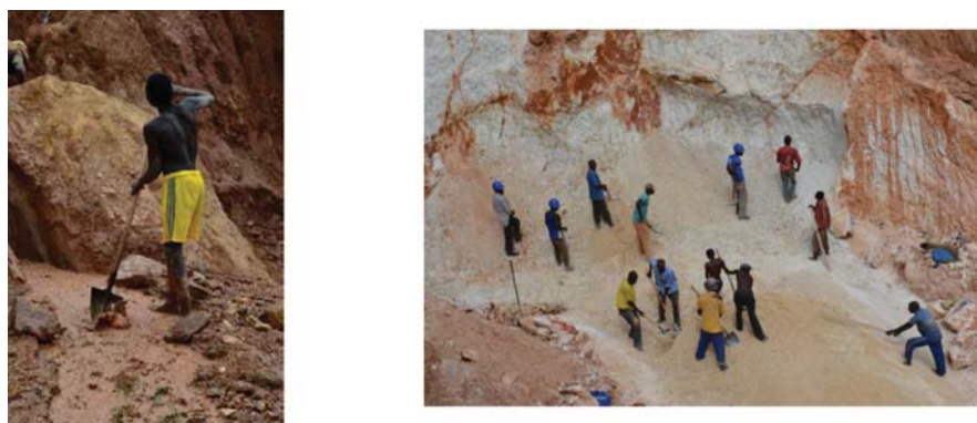
Figure 13—Artisanal mining without PPE