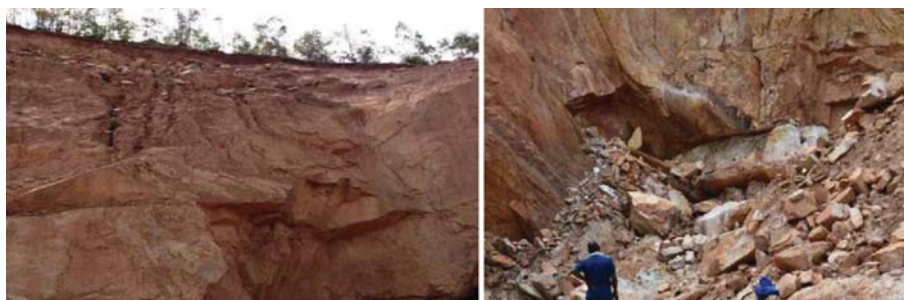
Figure 12—Potential accident situation due to falling rocks (left), and large rocks fallen from highwall

The implementation of mining standards on artisanal mining operations must be viewed in context of the working environment. Artisanal mining is currently a subsistence activity for most participants, thus safety standards may be seen as interference and having an adverse effect on workers'