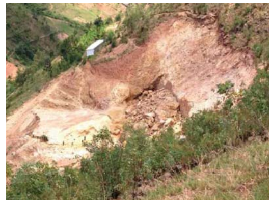
Figure 11—Example of a highwall collapse

with miners often carrying heavy loads (ore and/or concentrate). Also mining may take place adjacent to stronger, more competent rock, creating highwalls that contain unstable blocks. As a general rule, workers should not work closer to a highwall than 25% of the height of the highwall (the 'drop zone'). For example a bench height of 5 m would require a drop zone of 1.25 m. Note there may be other considerations for increase the size of this drop zone when applying highwalls above 5 m, for example considerations regarding shear plane failure or bench angles.