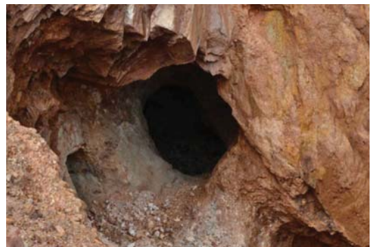
Figure 10—An example of undermining into a highwall