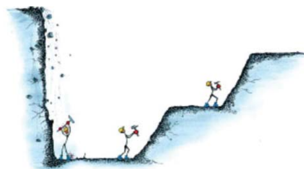
Figure 5—Sketch illustrating poor and good mining practices (Walle and Jennings, 2001)