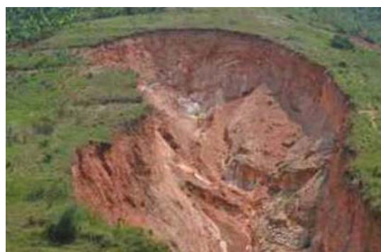
Figure 3—Typical highwall collapse

The biggest concern with surface mining is the widespread practice of undercutting steep pit walls to follow mineralized veins without a stable highwall or bench. Surface mining should be conducted utilizing bench mining (terraced) methods. Access to the pit floor is frequently treacherous,