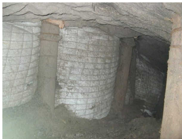
Figure 1—An example of the use of backfill in a platinum mine

The objective of the study was to choose between backfill and conventional support, and this forms the 'goal' of the AHP hierarchy as shown below. Regarding criteria, it was